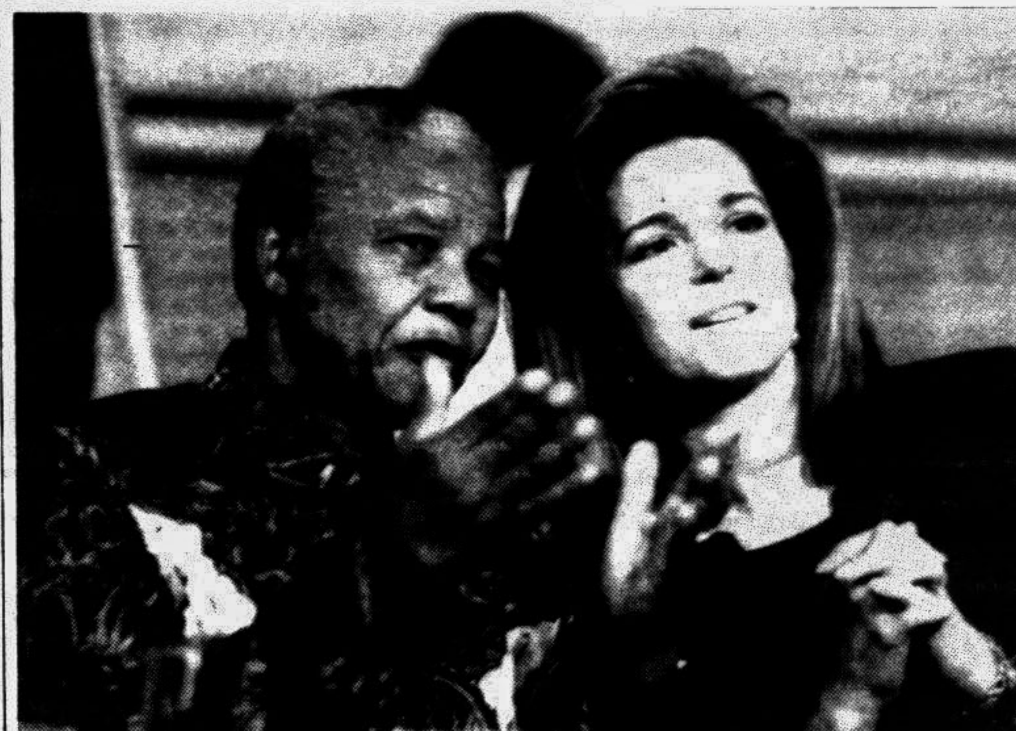
South African President Nelson Mandela (L) chats with Queen Norr of Jordan in her capacity as president of the United World Colleges at the opening of the annual congress in Johannesburg yesterday.

Police and witnesses said, some arms explosives and bombs, seized earlier, were being transferred by police from the old 'Maikhana' (store) to the new Maikhana in the recently constructed Collectorate building. Suddenly, a bomb fell from the hands of a constable and exploded.