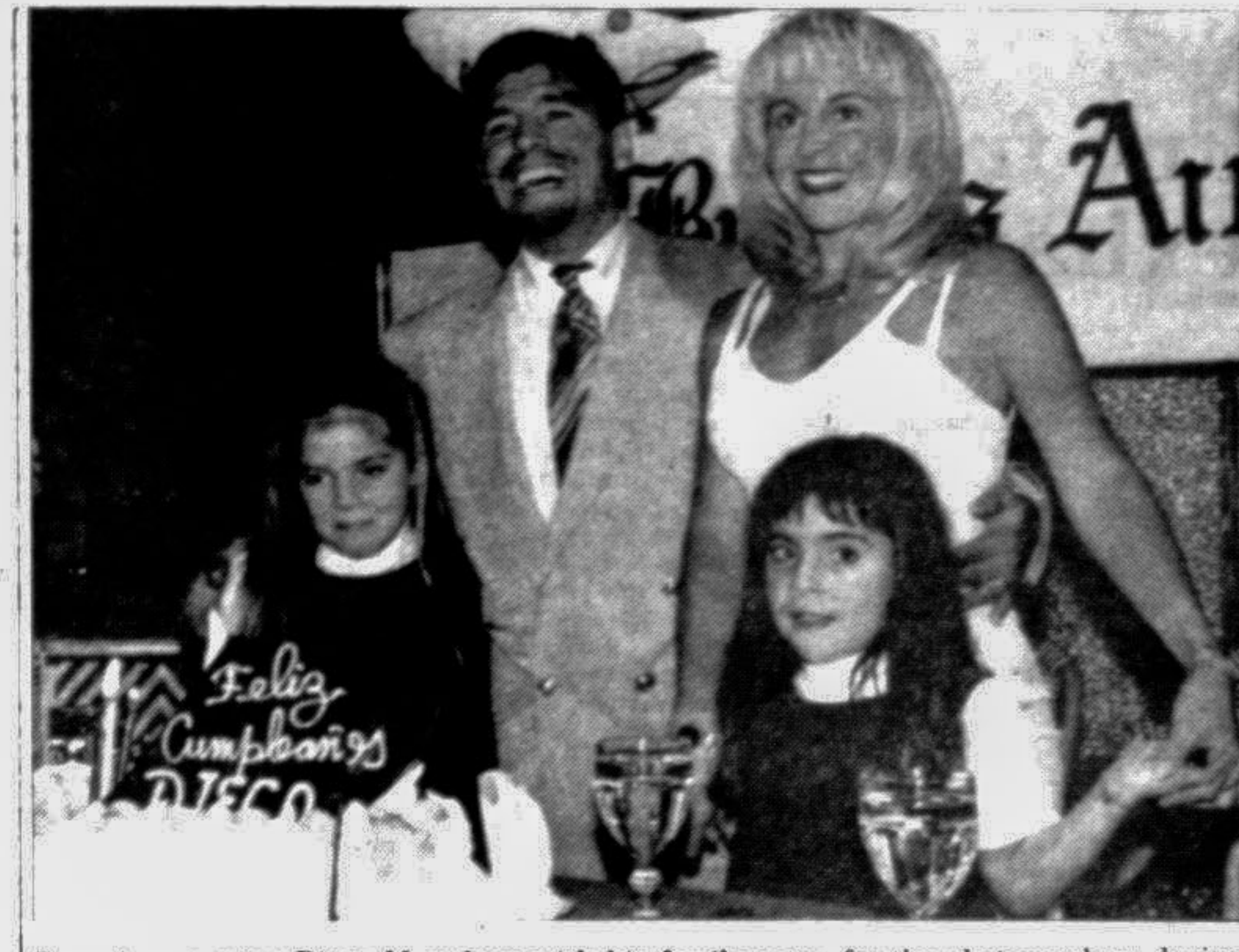
Soccer's superstar Diego Maradona with his family poses for the photographers during his 35th birthday party in Buenos Aires on Oct 30.