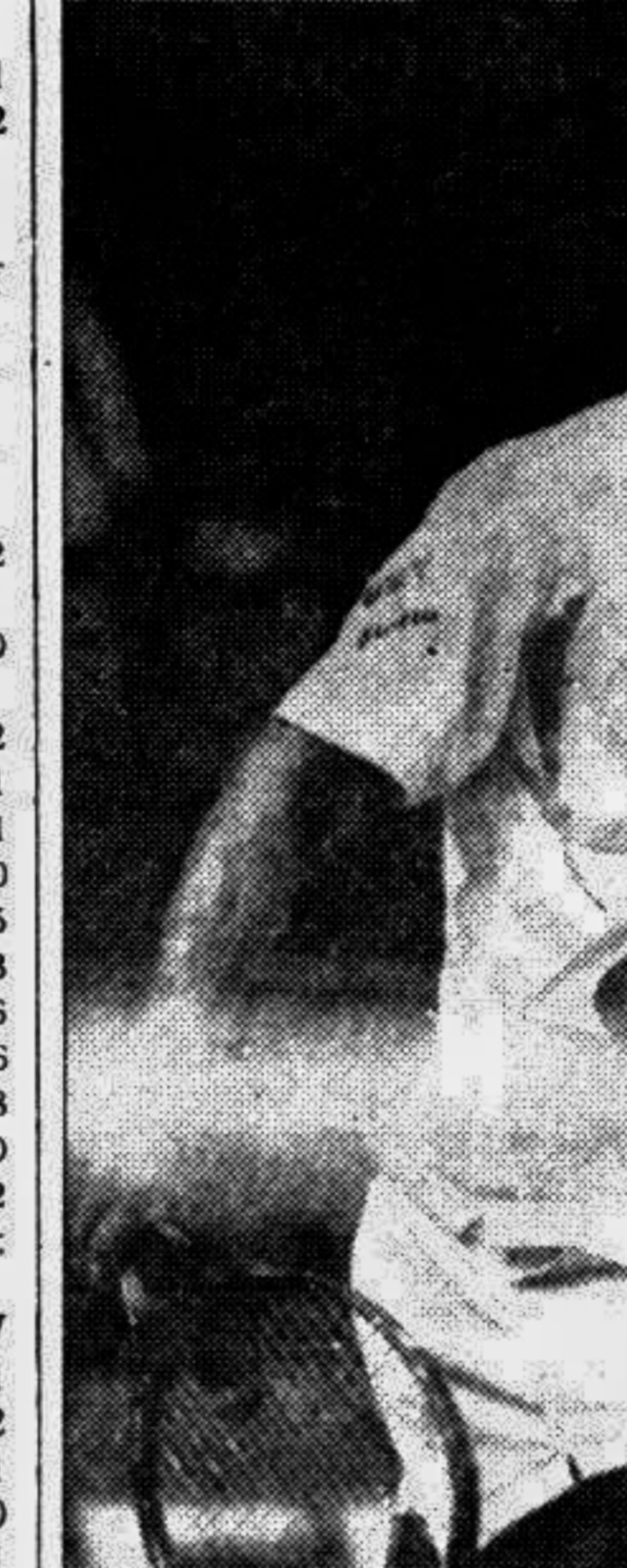
Clay-court maestro Thomas Muster of Austria goes into ecstasies after overcoming a spirited American Malivai Washington at the final of the Essem Open tournament in Germany on Oct 29. The world number three beat Washington 7-6 (8-6), 2-6, 6-3.

World No 3 Muster came good 7-6 (8-6), 2-6, 6-3, 6-4