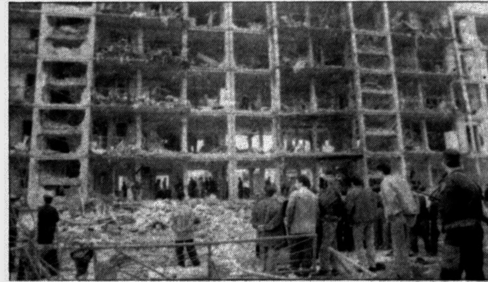
Residents look at a five-storey building that was almost entirely destroyed when a booby-trapped truck blew up Sunday in Rouiba, 15 km (nine miles) east of Algiers. Six people were killed and 98 injured in the blast. The attack came just hours after President Liamine Zeroul officially launched his election campaign ahead of the first round of the presidential polls on November 16.

Aziz asked Ghali to use his "significant authority to force a complete lifting of sanctions and stop interference in Iraq's internal affairs and respect its sovereignty and its people's right in choosing their form of government, INA said.