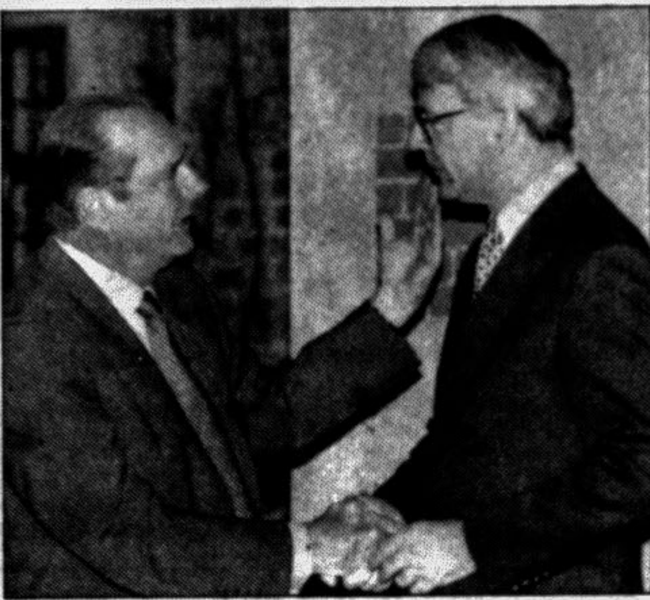
French President Jacques Chirac (L) chats with British Prime Minister John Major Sunday after he arrived at the country home of the Prime Minister.

Jet crash claims 1 in Brazil: A Brazilian fighter jet crashed during an air show in northeastern Brazil, killing its pilot, television reports said on Sunday. Reuter reports from Rio de Janeiro.