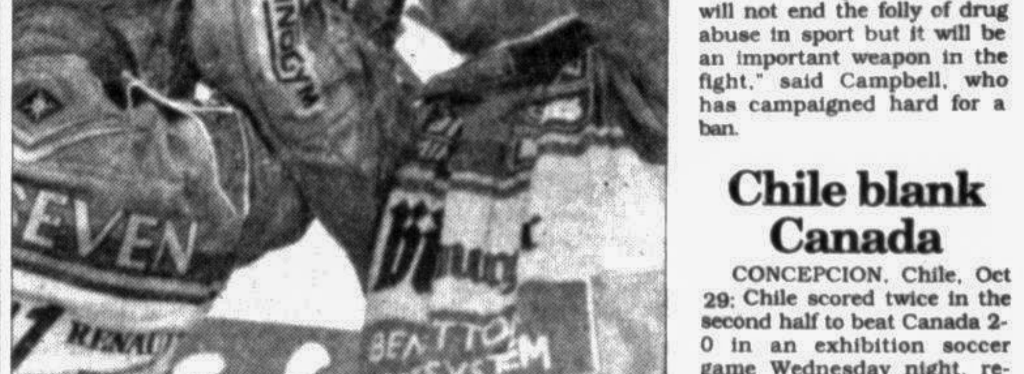
Michael Schumacher, 1995 and '94 world champion of Germany, sprays champagne at Johnny Herbert of Great Britain on the winners' podium at Japanese Grand Prix on Oct 29. Schumacher won the race and Herbert clinched third position.

Sebastian Rozental scored on a penalty kick in the 47th minute and Marcelo Salas added a goal 20 minutes later.