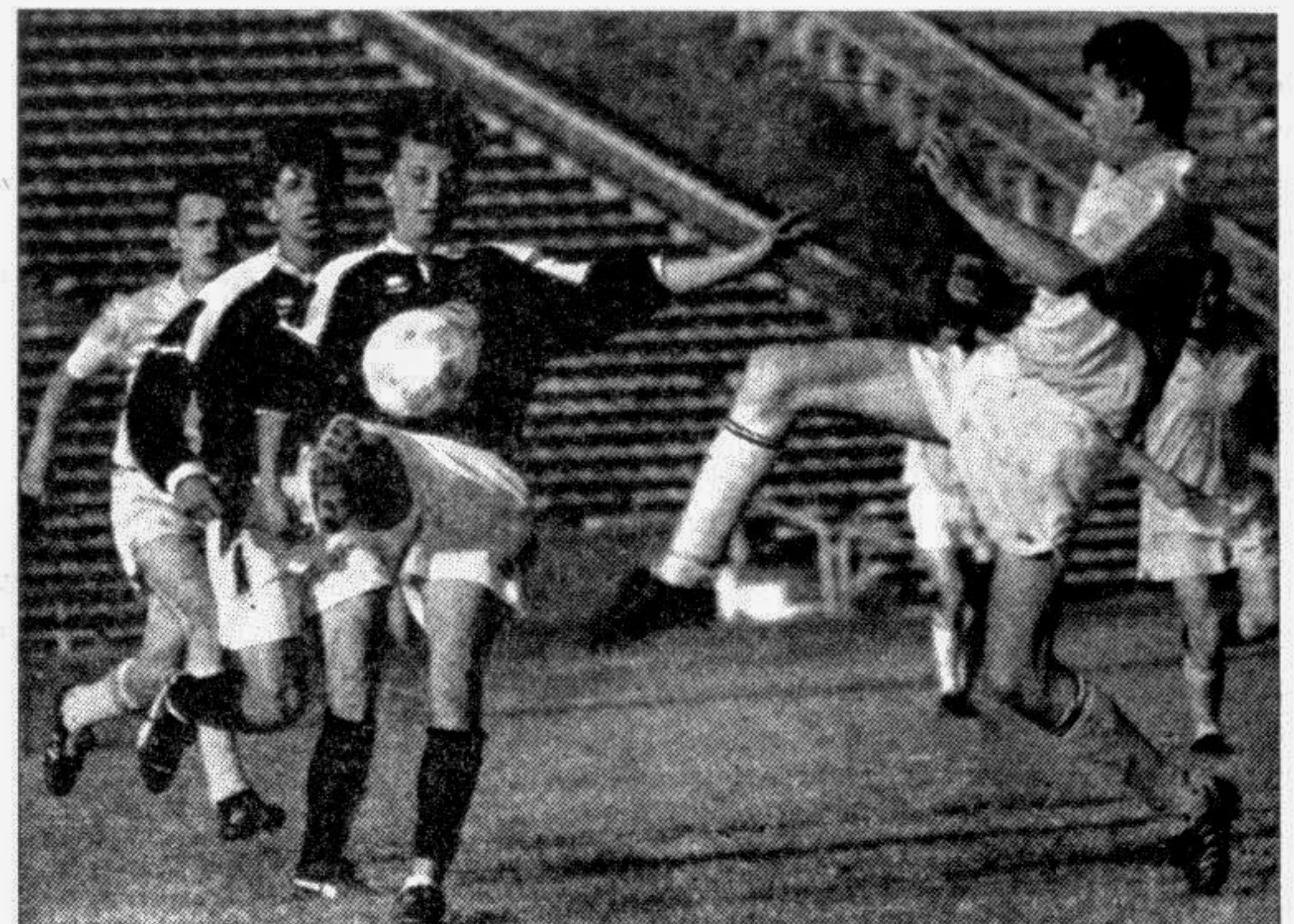
Players of FC Sarajevo (in black) and FC Travnik battle to take control of the ball during a rare soccer match at the Kosovo Stadium in the war-torn Bosnian capital Sarajevo on Oct 28. A crowd of about 700 turned out to watch the game which ended 1-1.

Ajax are also in European action next week with a Champions' League match against Grasshopper Zurich on Wednesday.