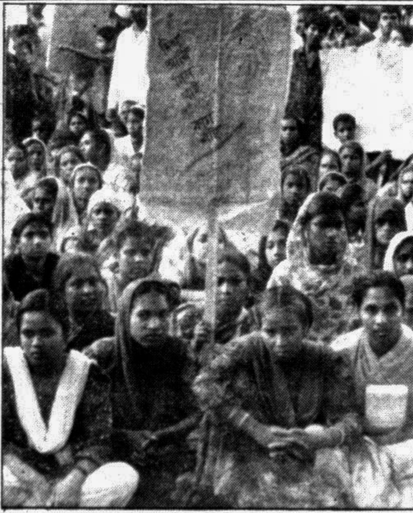
Jatiyatabadi Garments Sramik Dal staged a demonstration yesterday in front of the Jatiya Press Club protesting the frequent hartal calls.

3 get Rotary award. Rotary Club of Dilkusha will honour a primary teacher, a nurse and a postman with 'Vocational Service Award '95'.