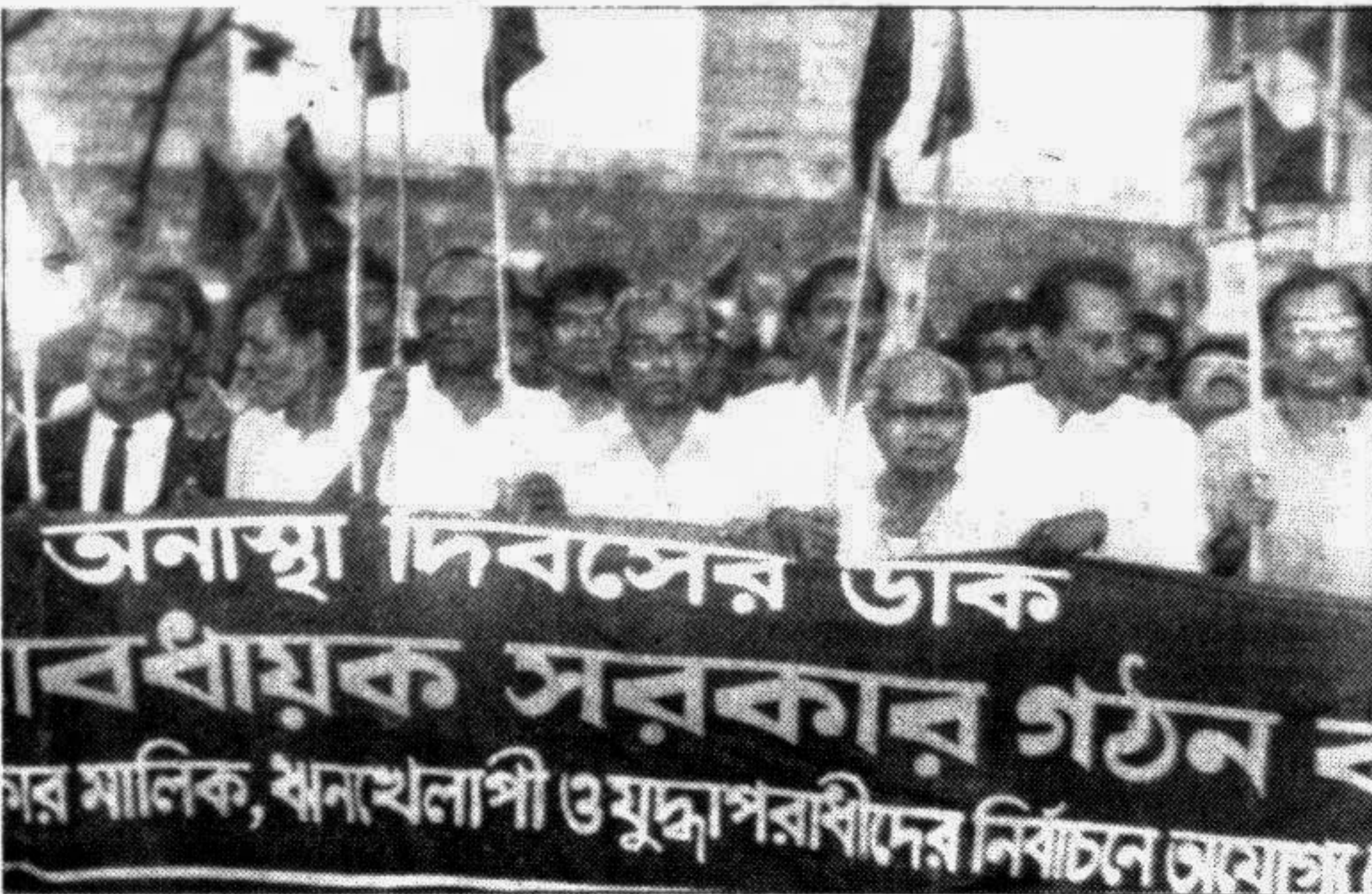
Left Democratic Front (LDF) brought out a procession in the city yesterday demanding election under a caretaker government.

and (presumably) French French etc etc! Need I say more?