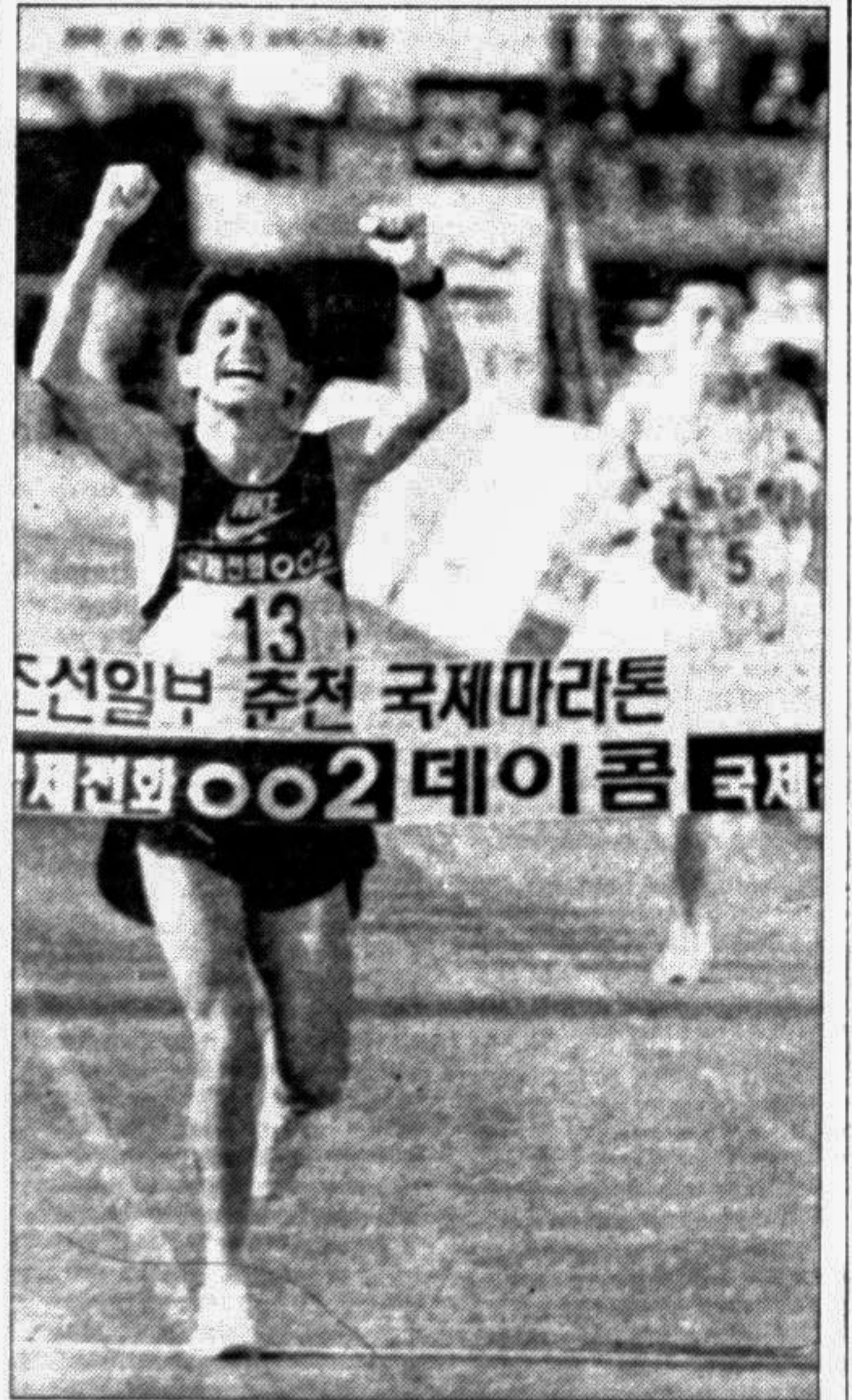
Rolando Vera of Ecuador crosses the tape to win the Chosun Ilbo Marathon in Chunchon, South Korea yesterday.

Playing at the Hiratsuka Stadium in the southwestern outskirts of Tokyo, Bellmare took control from the very beginning, encamping in the Sabah field for most of the match.