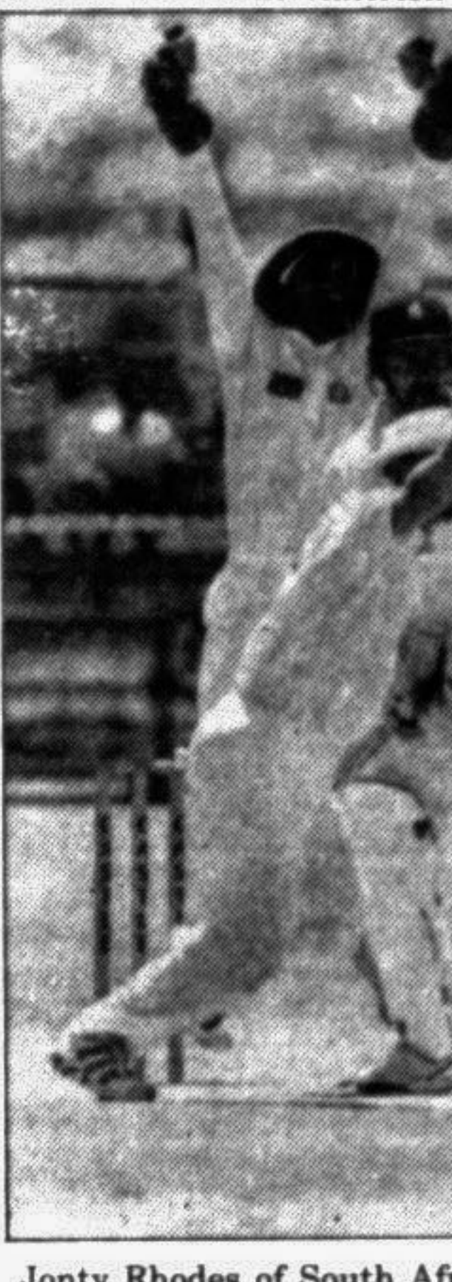
Jonty Rhodes of South Africa along with his teammates appeals for a catch-out of England's Richard Illingworth during their four-day match at the Soweto Cricket Oval, Johannesburg, on Oct 28.