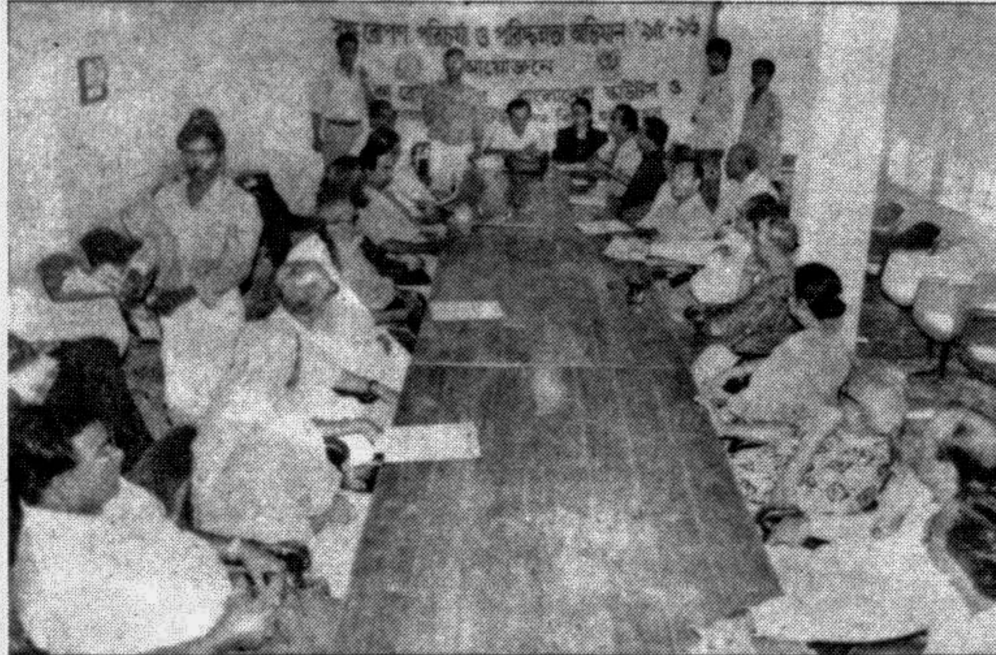
The Rotary Club of Dhaka and Bangladesh Scouts jointly organised a "tree plantation-nursing and cleanliness programme" at the Rotary Cancer Detection Centre in the city yesterday as part of the "Save Dhaka Clean Dhaka" campaign (above). Later a discussion meet was held at the centre in this connection.