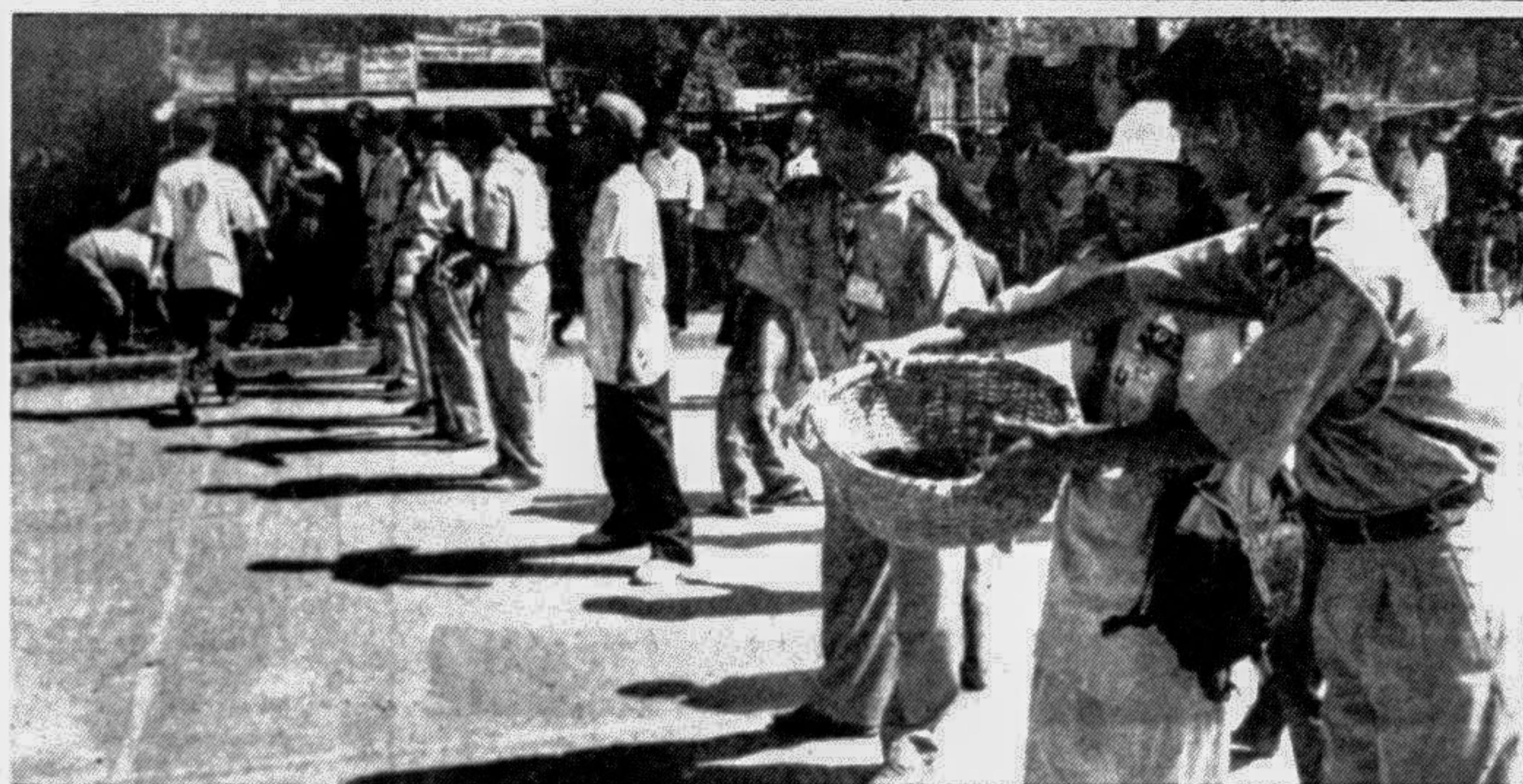
Rover Scouts participating in the 'Save Dhaka Clean Dhaka Campaign' at the Rotary Cancer Detection Centre at Mohakhali in the city yesterday.