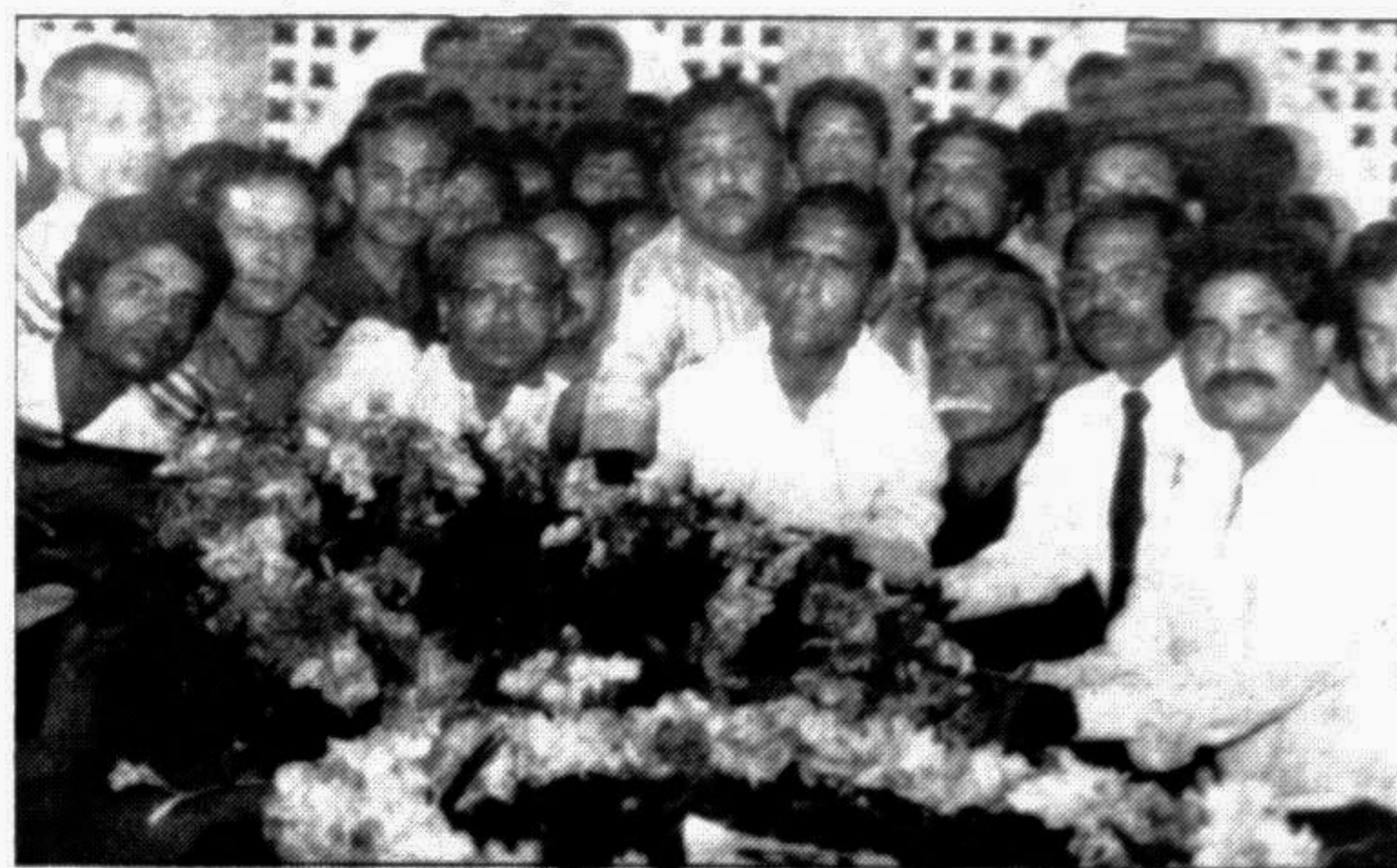
The Sher-e-Bangla Smriti Sangsad placing wreaths at the mazar of Sher-e-Bangla A K Fazlul Huq in the city on his 122nd birth anniversary yesterday.

They stabbed him indiscriminately. Later, the Jatiyatabadi Jubo Dal brought out a procession carrying the body and demanded arrest and punishment of the killers.