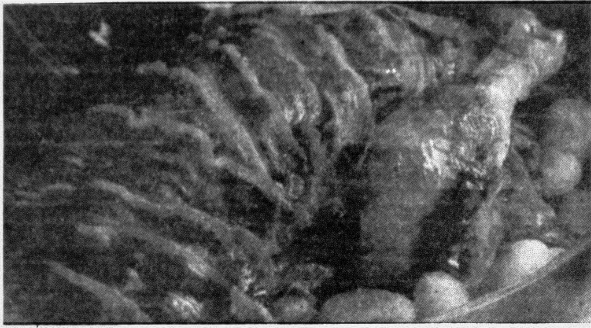
Frozen but fresh meat can be got at home.

Shopping is an art itself. In Dhaka's kucha bazaar , that art tests the limits of the customers' patience. Both for the heat generated by the spiralling of prices and for the thick crowds. To give you some relief, departmental stores have been opened. But to make your shopping there you have to have a fat wallet. Home services of some items have been introduced that makes life easier for many a home pressed for time. But until now the delivery system has confined to household goods of the stationery and grocery types. For fish and meat one has to take all the troubles of marketing. Fish vendors are there who come all the way to your door, but you have few choices there — both in terms of variety and quality. It seems the problem remains unsolved. But no longer.