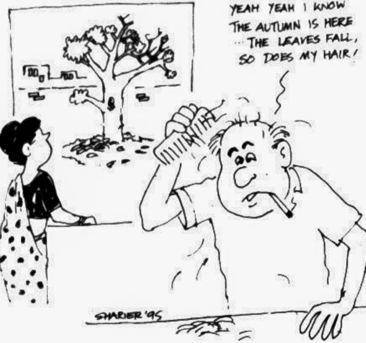
YEAH YEAH I KNOW THE AUTUMN IS HERE... THE LEAVES FALL, SO DOES MY HAIR!

Autumn, according to John Keats, is the seasons of ripeness. In this land too the sheafs of paddy turn golden in colour and the farmers ready themselves for the harvest of their main crop. But the Dhakaites are deprived of such a big seasonal event.