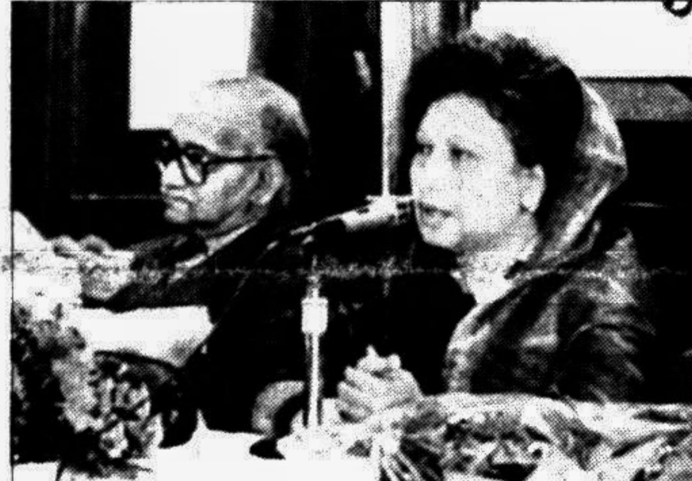
Begum Zia addressing a reception accorded to her in New York Saturday by Bangladeshis living in the United States.

NEW YORK, Oct 22: Prime Minister Begum Khaleda Zia categorically said that her government would not allow anyone to create any constitutional crisis in the country, reports BSS. At a reception accorded to her by the Bangladeshis living in the US at hotel Marriot at Time Square, she said those who had created artificial political problem in the country in the name of movement would not be allowed to create any constitutional crisis. Begum Zia gave a brief resume of the country's latest political situation when a host of Bangladeshis requested her to appraise them about it. She also told them that the BNP government had always shown utmost sincerity in the name of movement would not be allowed to create any constitutional crisis. Begum Zia gave a brief resume of the country's latest political situation when a host of Bangladeshis requested her to appraise them about it. She also told them that the BNP government had always shown utmost sincerity