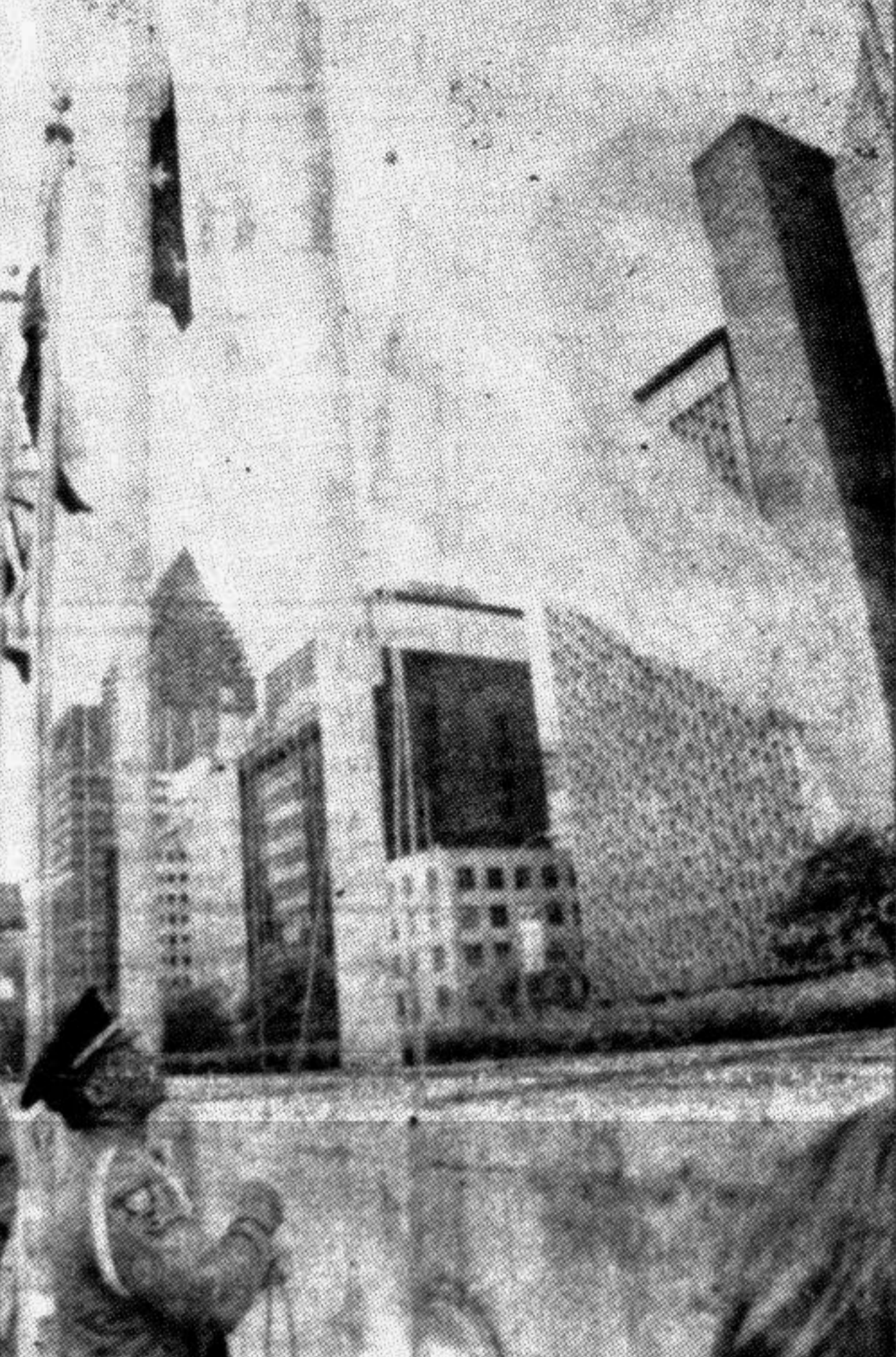
Flags of different countries are being raised in front of the United Nations in New York on the eve of UN special session.

Star Report Some of the country's leading business figures are on the list of defaulting bank directors who have been served with notices for repayment of loans. The meeting, the biggest since the end of the Cold War, will neither confirm nor deny. A senior Bangladesh Bank official, however, said he had not been informed of any repayment till today. "If they do not repay by the deadline, they will have to lose their directorship and face normal procedures by the scheduled banks to recover the loans." The Bangladesh Bank had served notices on nine private commercial banks in August and September asking them to recover the overdue loans amounting to about Taka 150 crore taken by directors of the banks within two months. The banks are: Arab-Bangladesh Bank, National Bank, Uttara Bank, United Commercial Bank, City Bank, IFIC Bank, Pubali Bank, NCCBL and Islami Bank. The central bank's serving officer said he had not been informed of any repayment till today. "If they do not repay by the deadline, they will have to lose their directorship and face normal procedures by the scheduled banks to recover the loans."