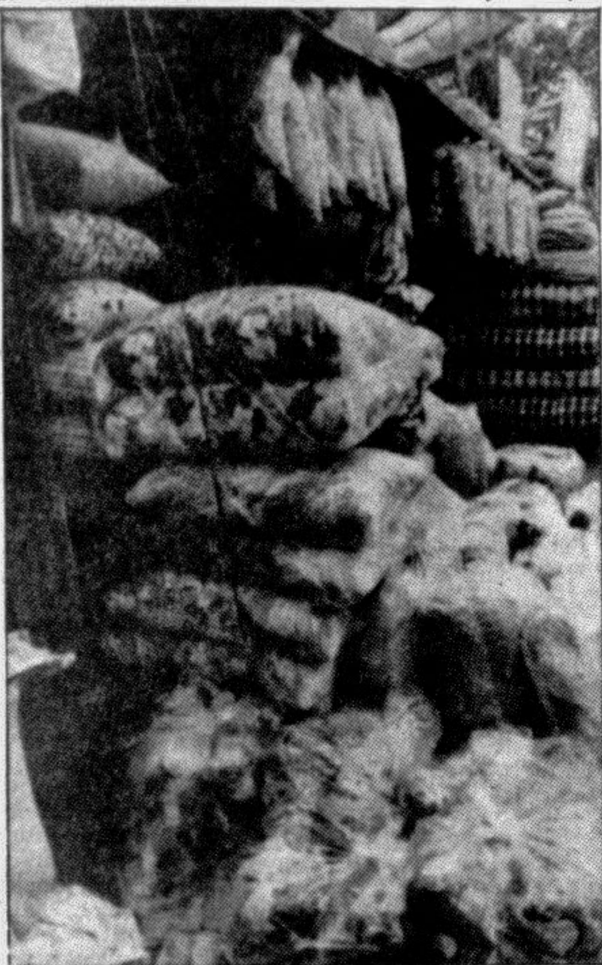
Colours in colourless place.

In these circumstances, should our aesthetic sense be kept confined to the few patches of beauty as provided by the multi-coloured pillow covers on some city pavements. Some idyllic not-so-important beauty spots may yield places to modern structures with their drab exteriors necessitated by commercial considerations. However, for the present, this narrow space presents a refreshing spectacle of colours in the midst of bewildering traffic jams always clogging this area.