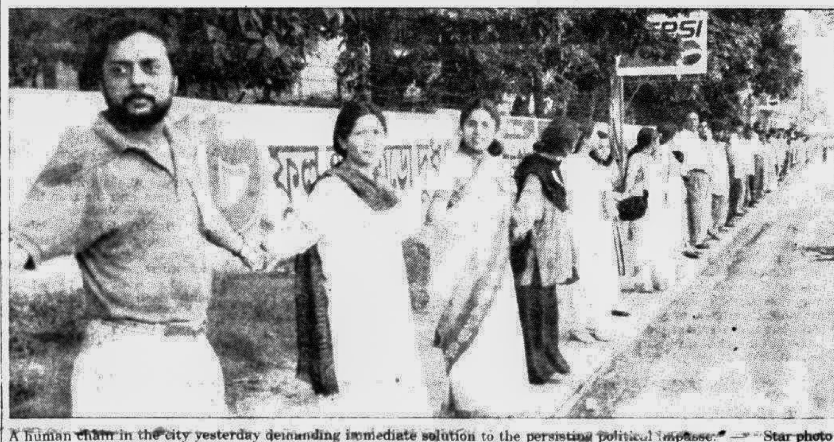
A human chain in the city yesterday demanding immediate solution to the persisting political impasse.

Sports Reporter The Sri Lankan cricketers delighted a partisan crowd from across the sub-continent when they comprehensively beat the mighty West Indies to lift the Singer Champions Trophy at the desert venue of Sharjah yesterday. Playing in front of a boisterous and colourful crowd, the spirited islanders displayed a superior brand of cricket altogether to outclass the defending champions — ultimately winning the high-scoring match by 50 runs. Sent in to bat by the West Indies skipper Richie Richardson, the Lankans took full advantage of a placid wicket amassing 273 runs before being all out with one ball to go in the allotted 50 overs. In reply, the Caribbeans could only muster 223 before being all out.