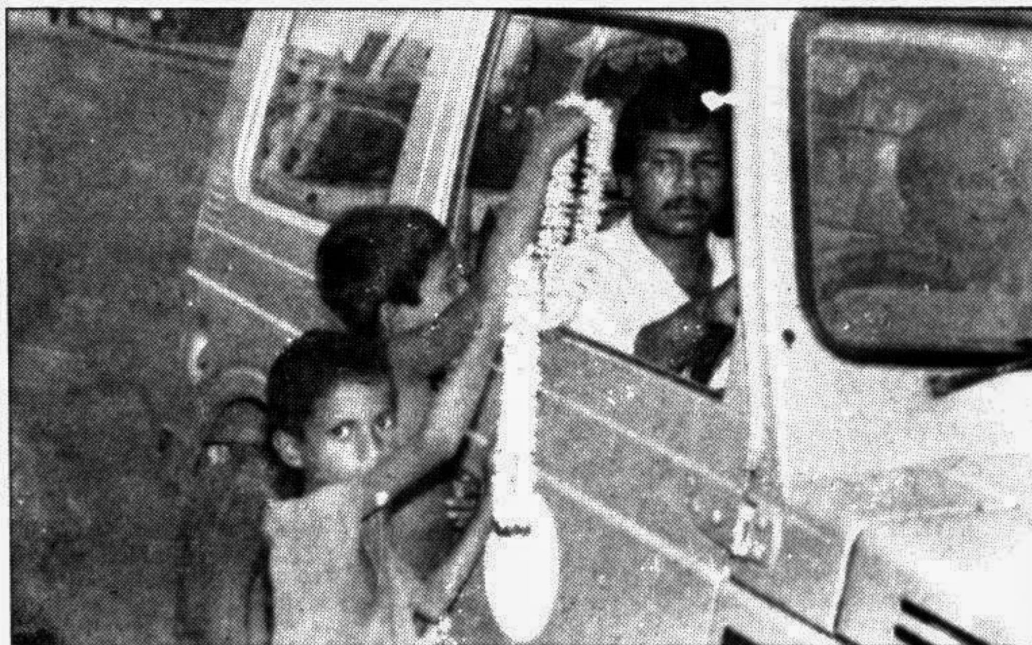
"I sprinkle water on them in hope to hold back their freshness."