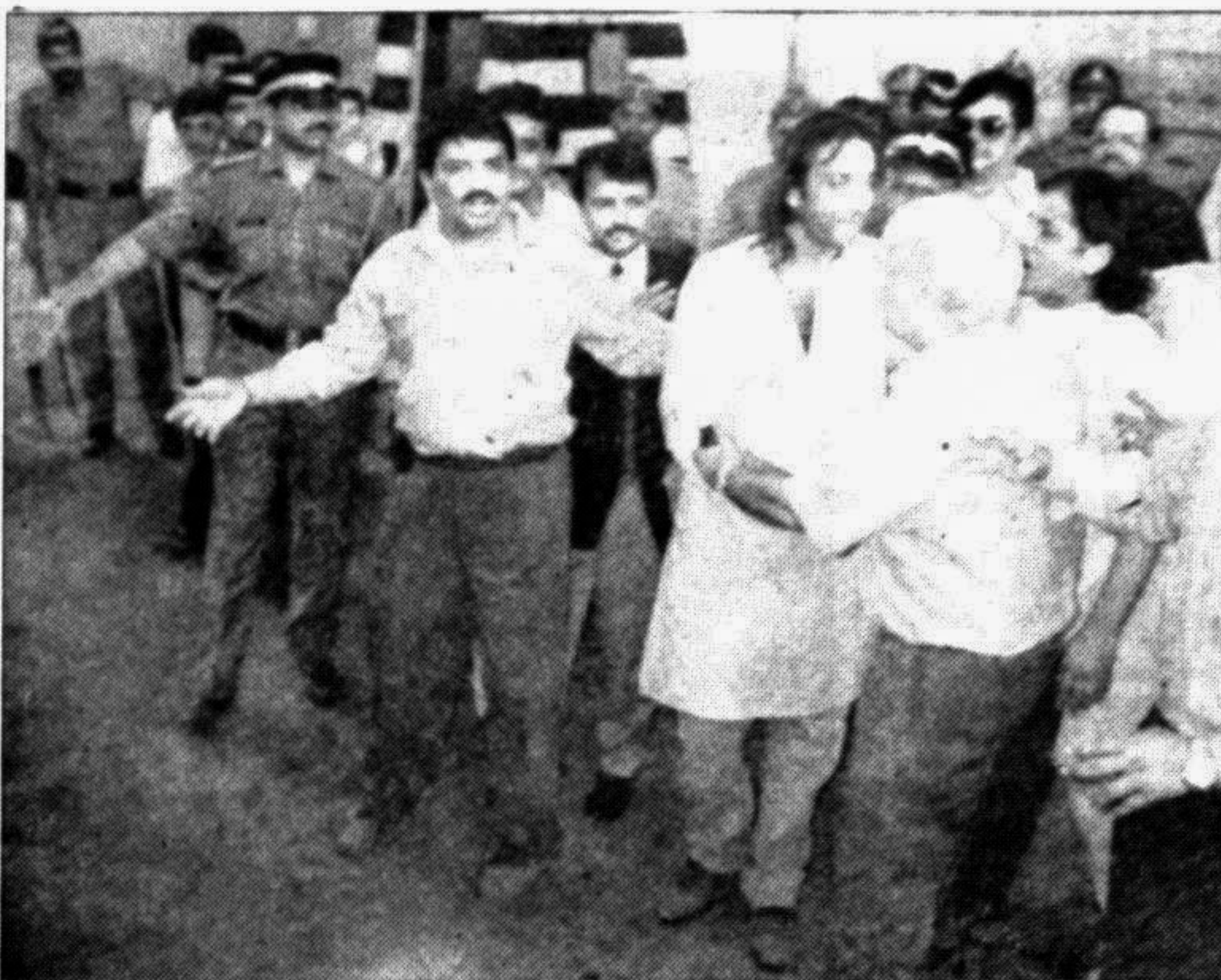
Indian movie star Sanjay Dutt (2nd R) is greeted by film producer Yash Chopra (R) upon his release from Anther Road prison in Bombay Tuesday after being granted bail.

The acting Secretary General of the ruling party also said the party was likely to hold a grand public rally in the capital sometime next month.