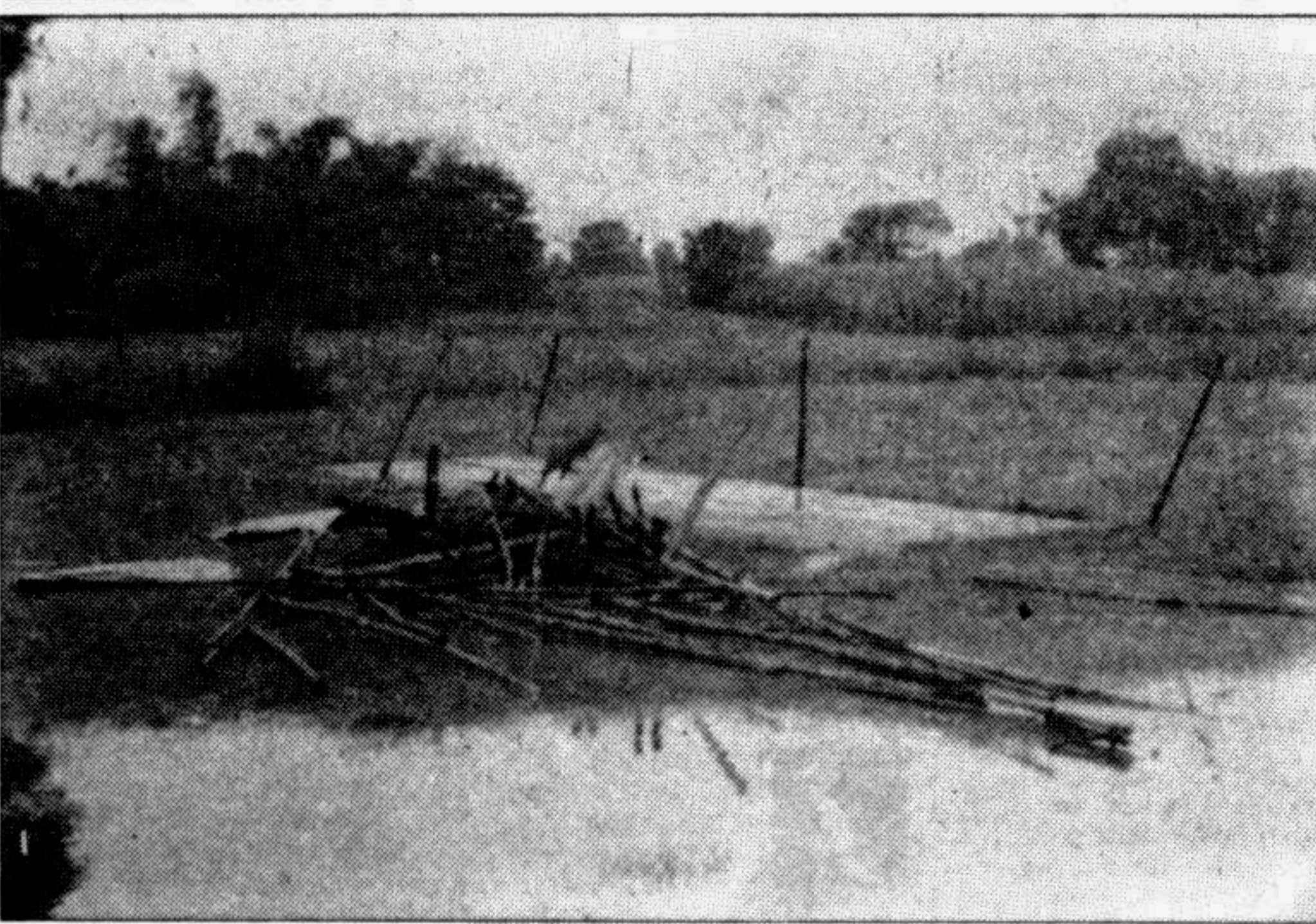
JAMALPUR: Kazaikata, a non-government registered primary school was completely damaged by the tornado here on September 28.

From Our Correspondent GAIBANDHA, Oct 18: Railway security force in a drive recovered huge Railway property from village Sakoa adjacent to Bharatkhal Railway station and arrested one person in this connection. On a secret information a contingent of Bonarpara and Teestamuk ghat security forces launched a joint drive at village Sakoa under Shaghata thana at the dead of the night recently. The contingent recovered two pieces of 40 feet long and six pieces of four feet long rails from a road side ditch. In this connection Asgar Ali was arrested by forces and they recovered some cutting instruments and equipment from his possession. Some other associates of arrested person, however, managed to flee. It may be mentioned here that an organised gang of miscreants in collaboration of some dishonest railway employees have been lifting railway properties and fuel from Bonarpara, Bharatkhal and Teestamukghat siding since long.