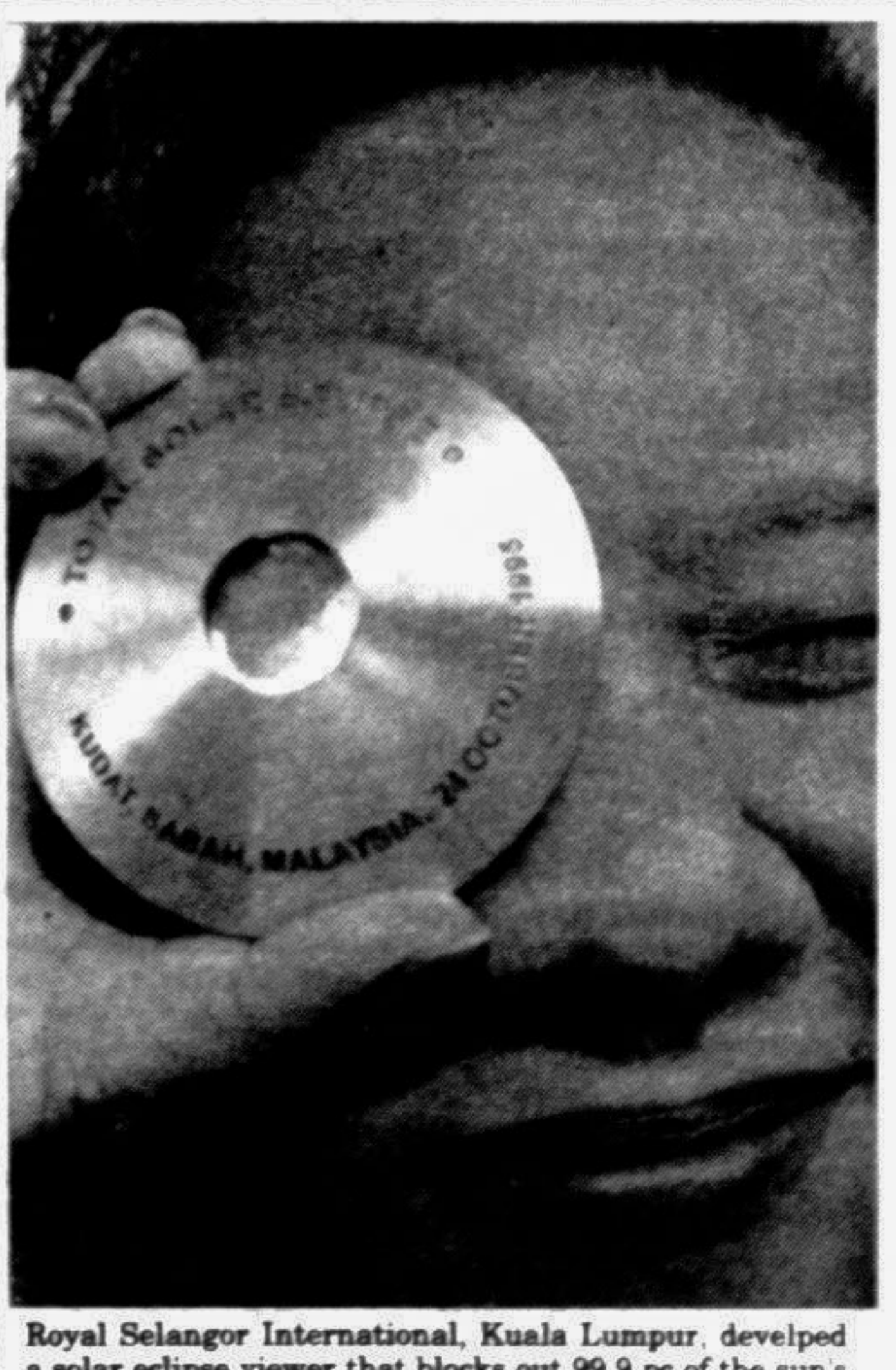
Royal Selangor International, Kuala Lumpur, developed a solar eclipse viewer that blocks out 99.9 pc of the sun's radiation.