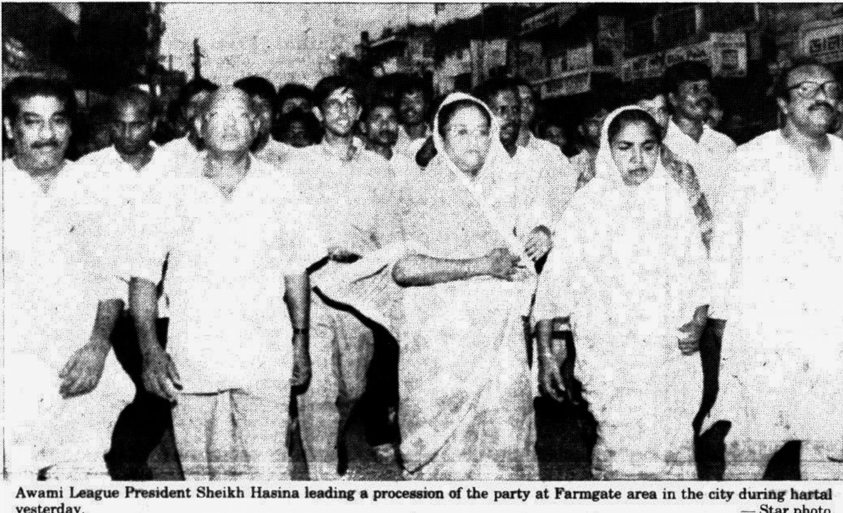
Awami League President Sheikh Hasina leading a procession of the party at Farmgate area in the city during hartal yesterday.