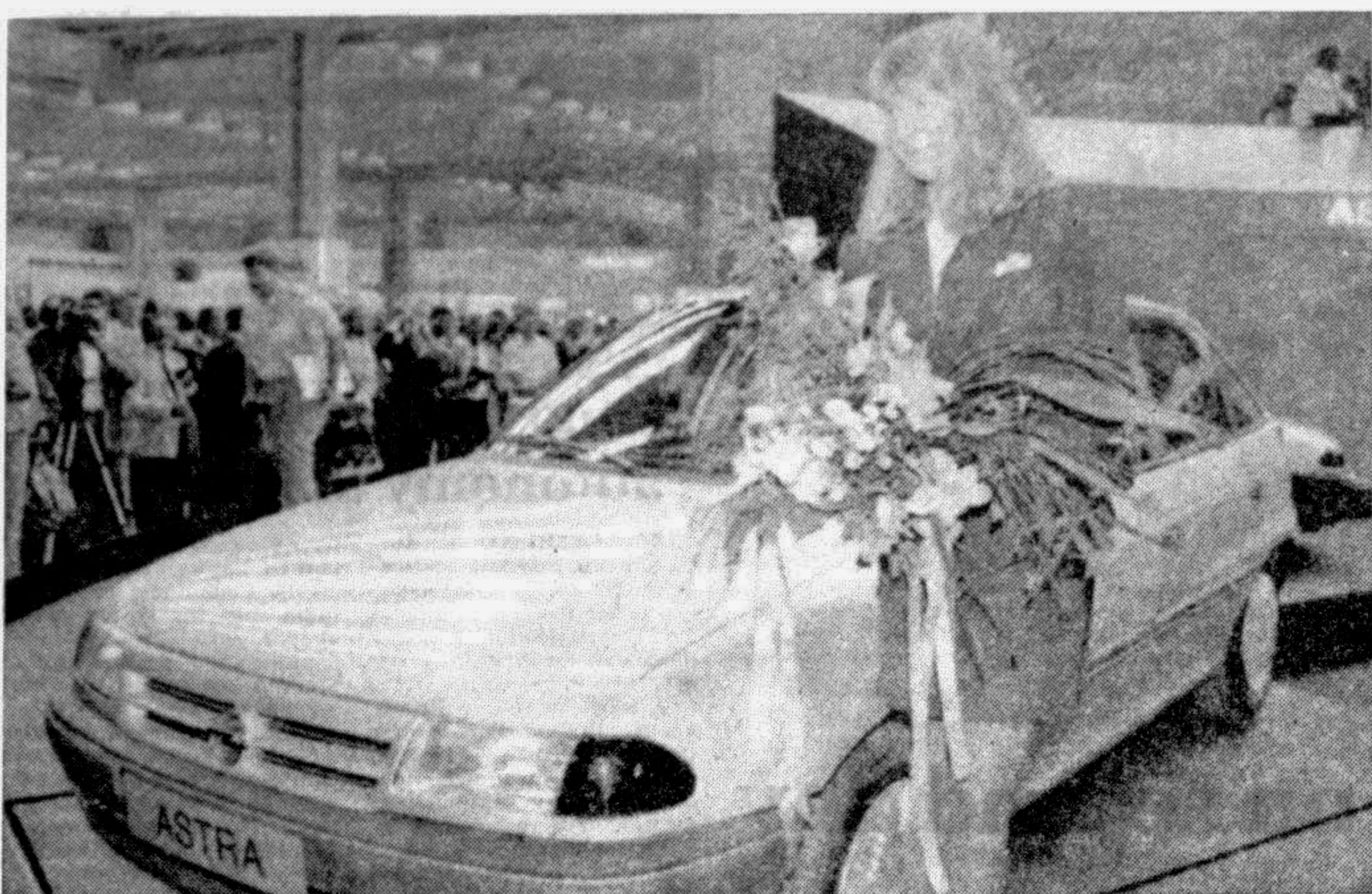
A dated file photo shows German supper star Steffi Graf standing beside an Opel Astra at the international automobile exhibition in Frankfurt. Opel declared on Monday that it was not going to renew the sponsorship deal with the scandal-prone tennis player.