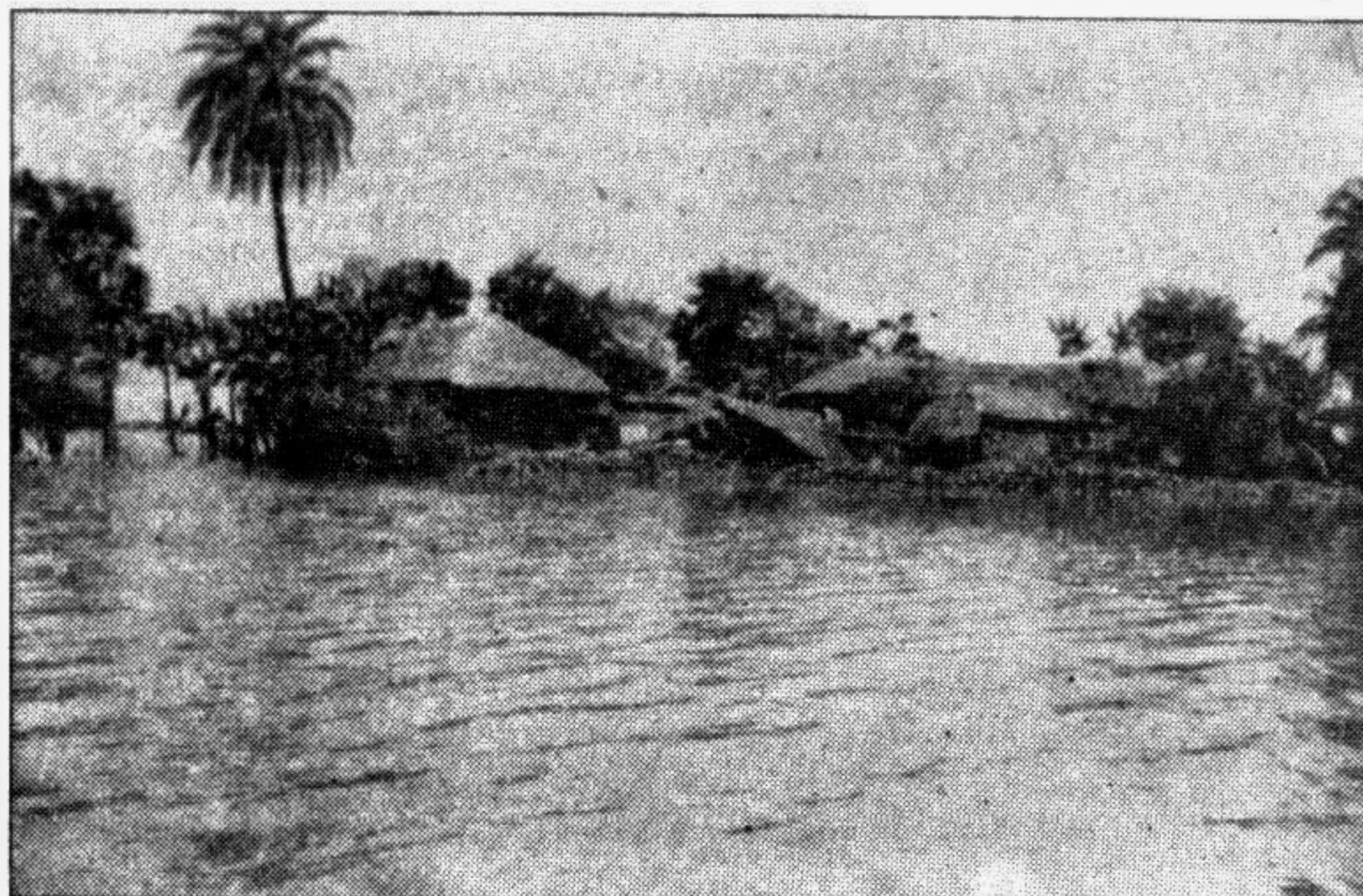
RAJSHAHI: Floods inundated and damaged 70 per cent houses in Sonadanga village of Bagmara. This photo was taken on October 10 last.