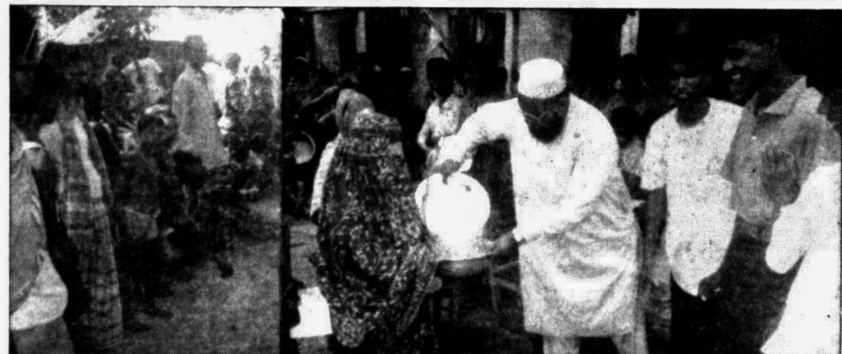
RAJSHAHI: Rajshahi Imam O Ulema Samity collected and distributed about 70 mounds of rice, 40 mounds of chira, one and a half gunny bag biscuit, three cartoon medicines and about 5000 pieces of clothes among the flood-hit people of Tanore, Mohanpur, Bagmara and Poba thana of Rajshahi district recently.