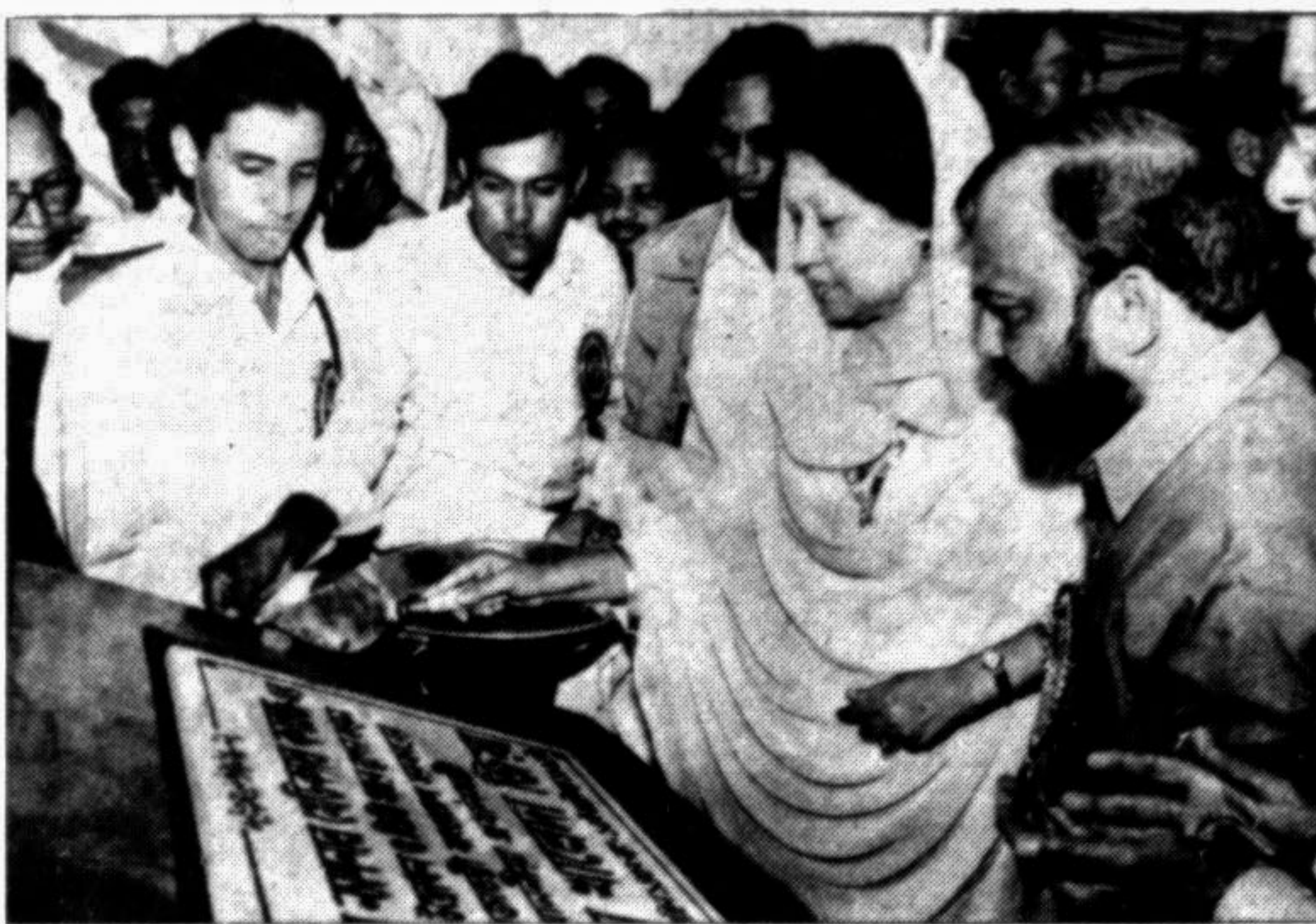
Prime Minister Begum Khaleda Zia laying foundation stone of National Medical College in the city yesterday.