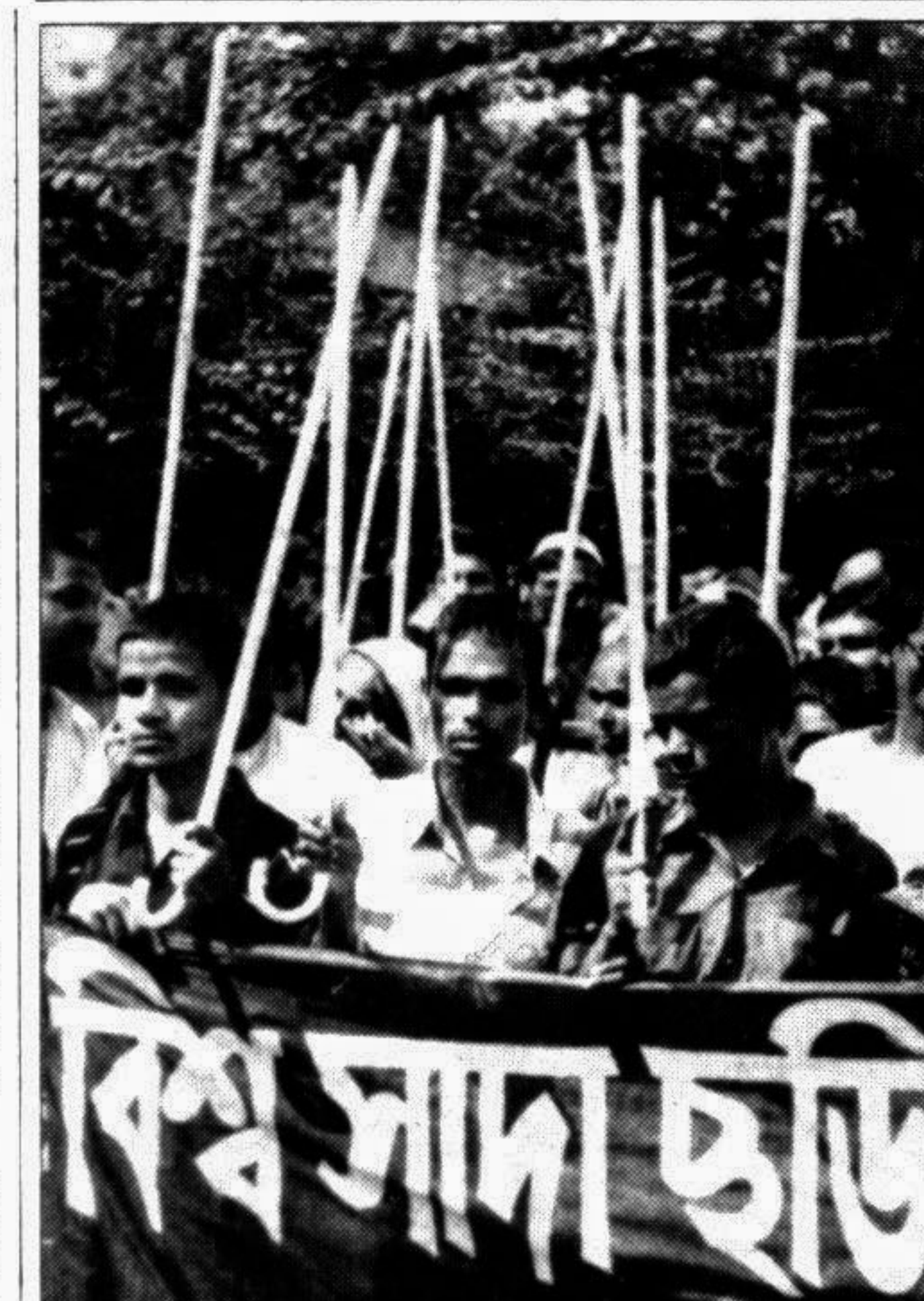
Welfare Association for the Blind brought out a procession in the city yesterday to mark the World White Cane Safety Day.

Apart from the housing grants, the government will soon undertake housing rehabilitation credit programme. Agriculture Minister Abdul Mannan Bhuiyan told the meeting that his ministry had already started an agriculture rehabilitation scheme involving Tk 13 crore. Also, rabi crop rehabilitation programme is being undertaken in the affected districts. See Page 12 Col 7