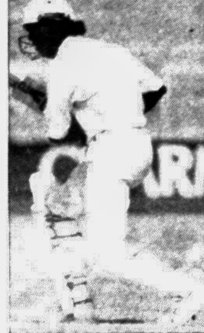
V KAMBLI... 104

New Zealanders began their second knock rather disastrously as both their openers, Bryan Young and Roger Tiose fell with just one run on the board.