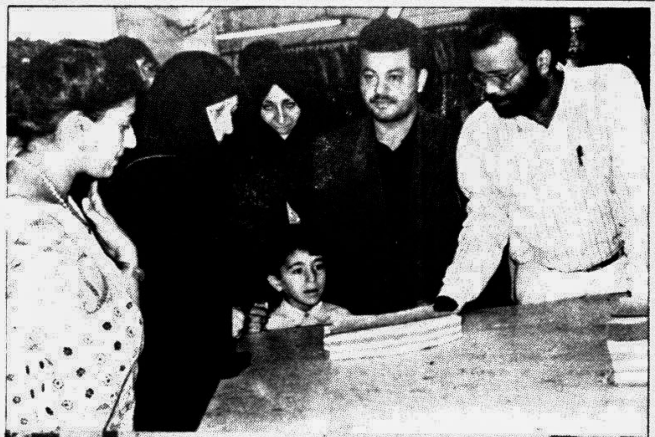
Madam Akbar Hashemi Rafsanjani, wife of the Iranian President visited Rafikat Garments Factory at Green Road in the city yesterday.

ISLAMABAD, Oct 11: The government of Pakistan has suspended the export of raw cotton despite an estimated 10 million bales of bumper crop of cotton this year, reports Xinhua.