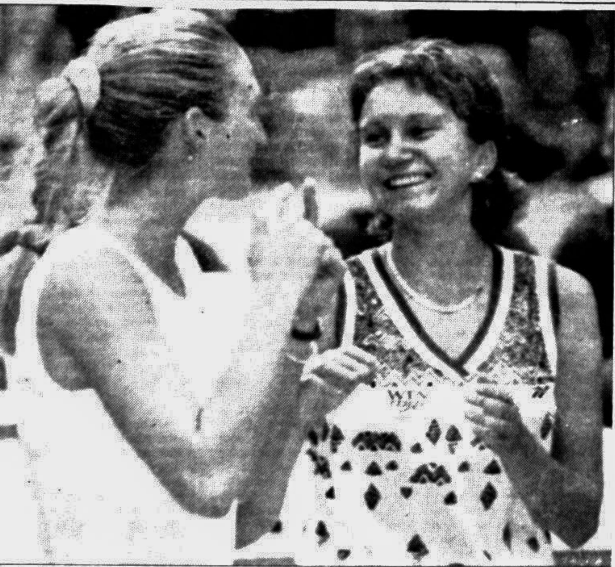
Australian Open champion Mary Pierce(L) and Croatian youngster Iva Majoli engage in a friendly conversation after their title-deciding match at the European indoor tennis championships in Zurich on October 8. Majoli triumphed over her illustrious opponent 6-4, 6-4, to win her first major title.

The match, attended by 10,216 fans was the first on a Saudi world tour that includes a match against Mexico in Los Angeles on Wednesday, followed by two games in Japan and one in South Korea.