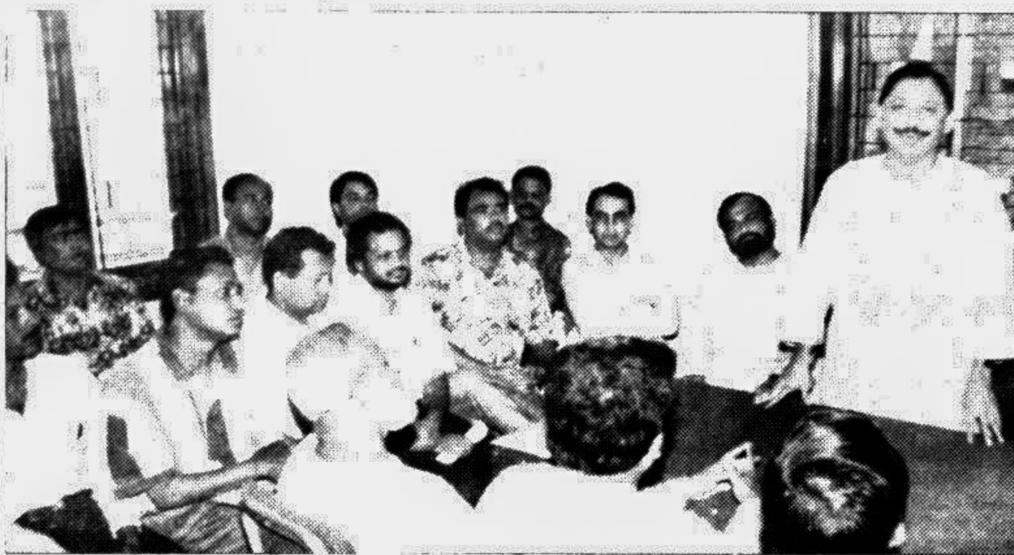
Labour and Manpower Minister Mir Shawkat Ali speaking at an emergency meeting of the city unit of BNP yesterday.

The JCD leaders also said, it would not be possible for the opposition to oust the BNP government through hartal, strike, gherao and false case.