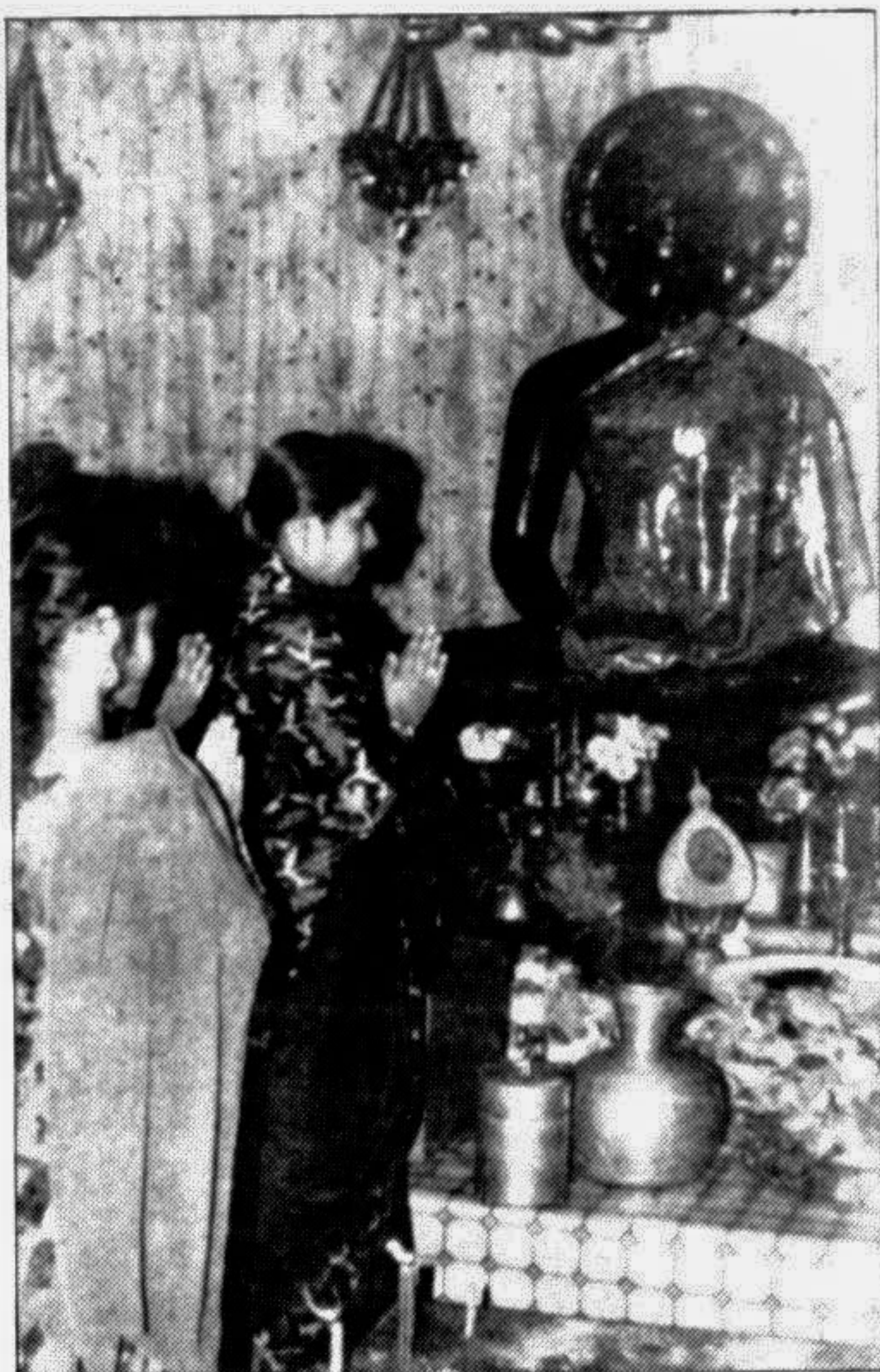
Devotees offering prayers at the Buddhist temple in Kamalapur of the city on the occasion of Prabarana Purnima yesterday.