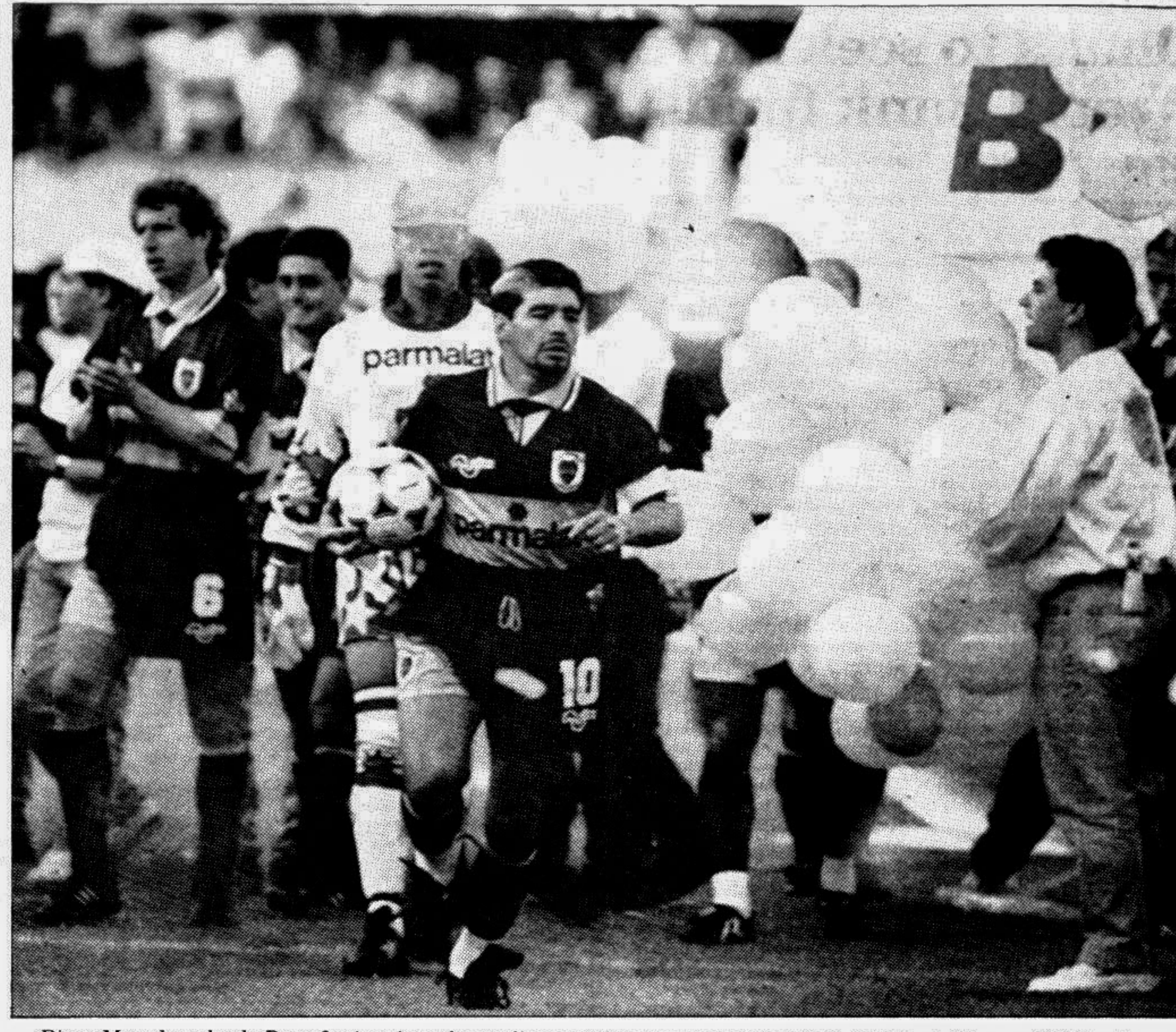
Diego Maradona leads Boca Juniors into the stadium amidst colourful celebrations in Buenos Aires on October 7.

DUITAMA, Colombia, Oct 8: Jeannie Longo of France won her second gold medal in three days with a victory in the 85.5-kilometre (53.1-mile) women's individual race in the World Cycling Championships, reports AP.