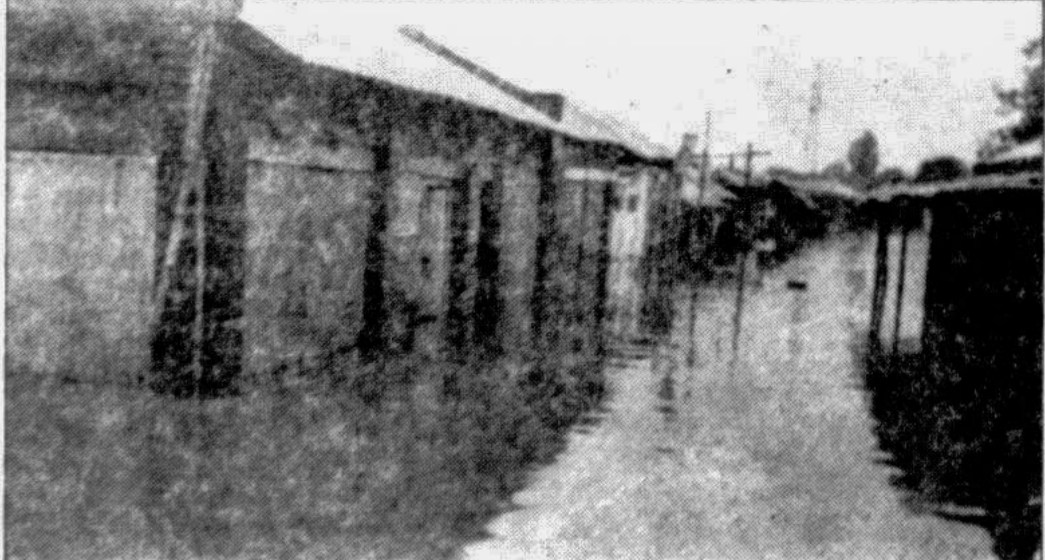
GAIBANDHA: A market area in Gobindaganj thana submerged by flood water. The photo was taken on October 1 last.