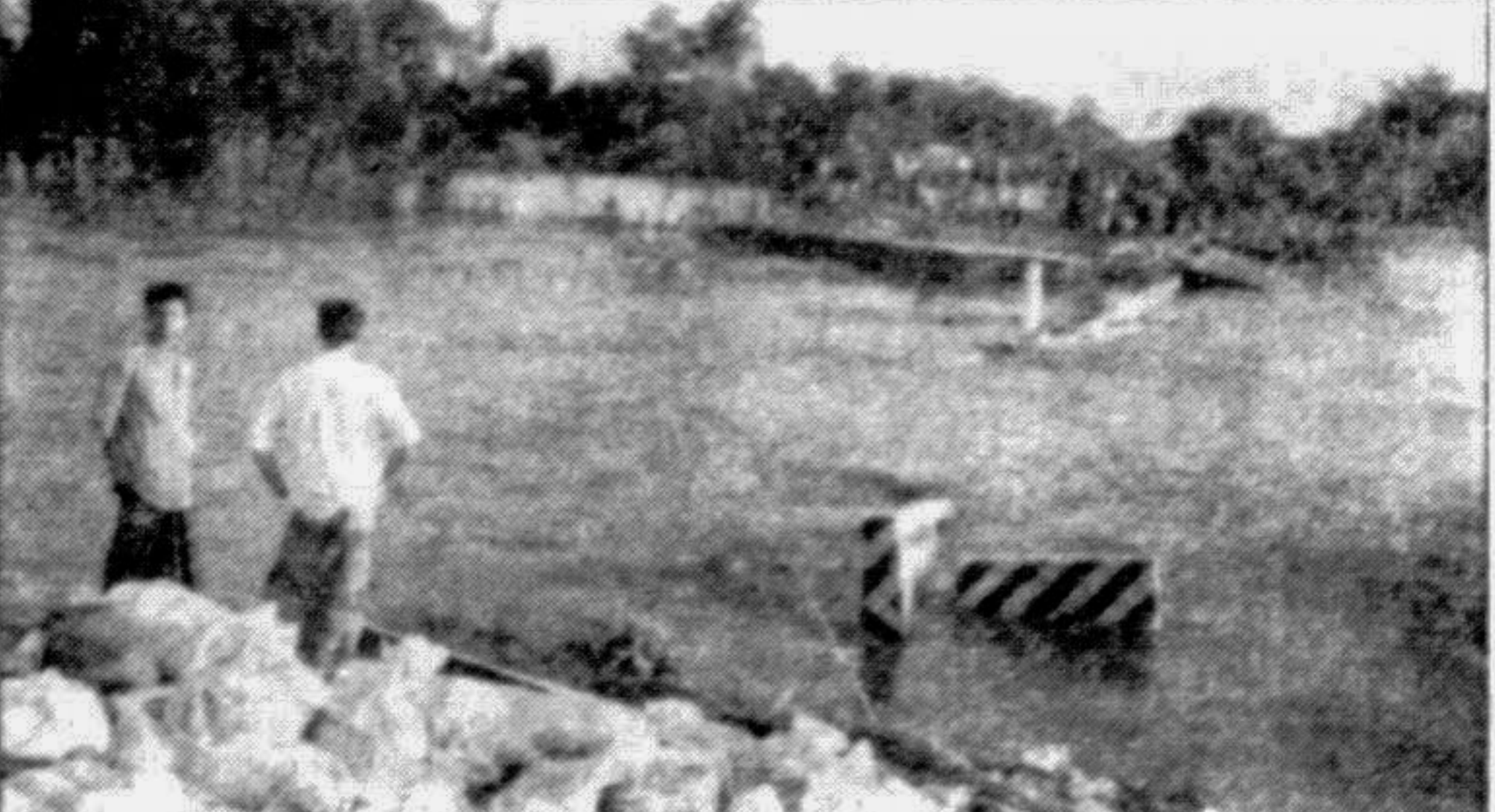
GAIBANDHA: About 100 feet long breach developed at Taltola along the national highway disrupting road communication in eight northern districts. The photo was taken on October 5.

section could not be restored immediately. But a vigorous attempt will be taken to restore communication as soon as the water started to recede, said the concerned authorities. About eight lakh people remain marooned at different locations following sudden inundation of dwelling houses. Standing crops like Aman, Sugarcane, Banana plants on vast tract were damaged completely. Innumerable village roads, bridges and culverts of Sadullapur, Palashbari, Gobindaganj and Shaghata either collapsed or were washed away by flood water. In the meantime, though