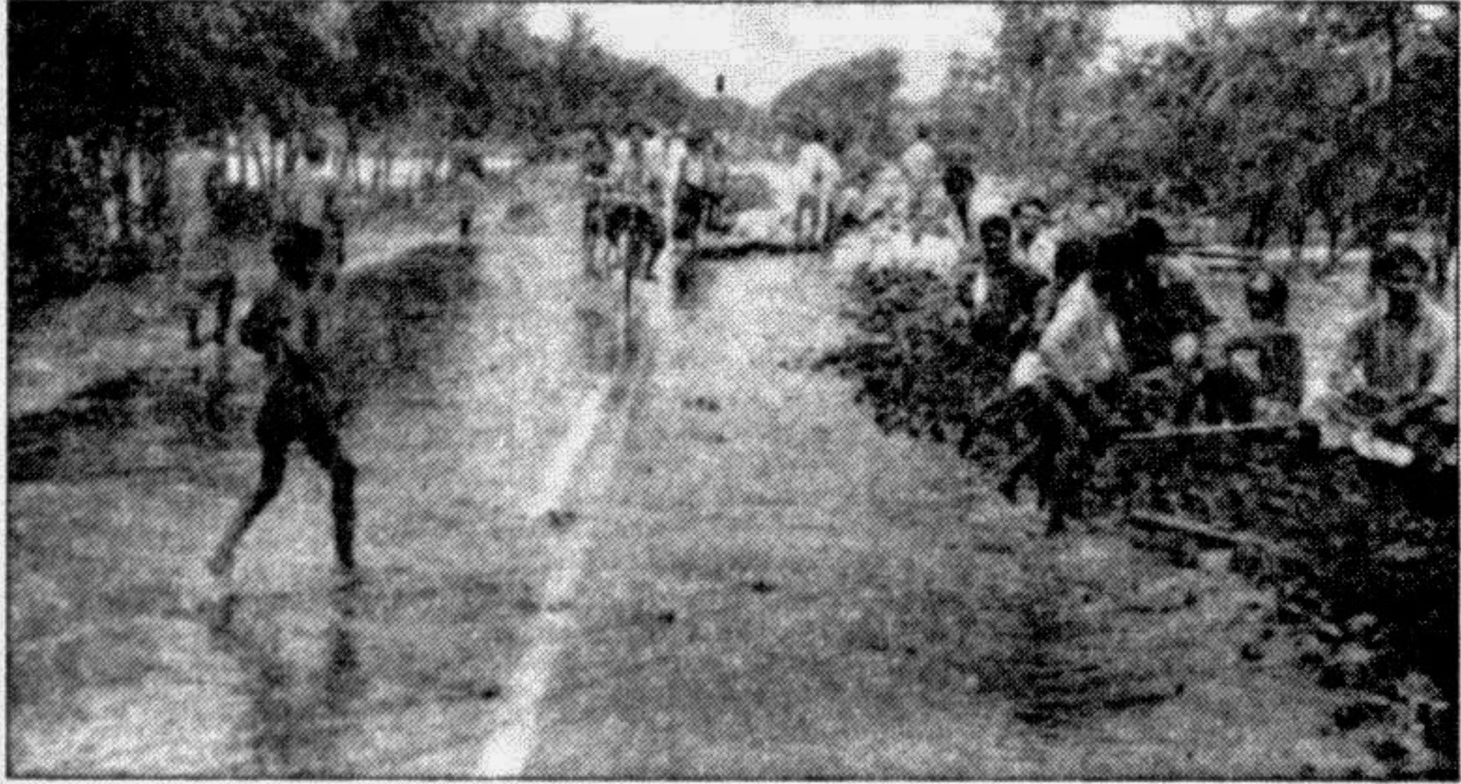
GAIBANDHA: Roads and Highways personnel placing brick-bates and sand bags by the side of the national highway to prevent overflowing of flood water.

submerged by one foot deep flood water along half kilometre area near Katakali under Gobindaganj thana and continued to threaten road communication of northern districts. Road communication between Gobindaganj-Dinajpur via Ghoraghat was snapped on September 29 as a large portion of highway went under three to four feet deep flood water at Khalshi and movement of all kinds of traffic on this route had to be suspended for an indefinite period. On October 1 at 11 am the national highway communication with northern areas was cut off following collapse