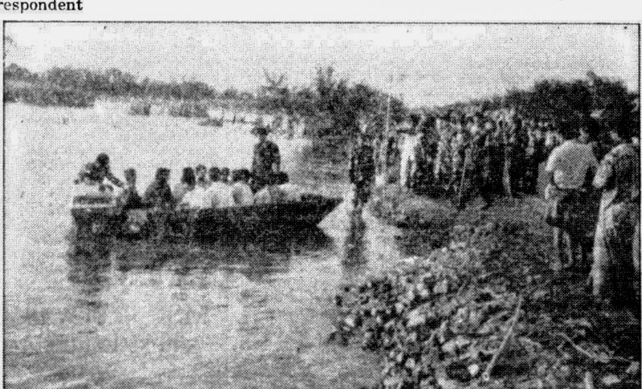
GAIBANDHA: Army boats have been deployed at breach points of the national highway in Taltola of Gobindaganj thana ferrying passengers.

GAIBANDHA, Oct 8: Flood hit Gaibandha district for the fourth time during this current season that left a trail of devastation including disruption in national highway and railway link. Heavy onrush of flood water from neighbouring Indian territory and continued downpour flooded vast tract of northern region. A total of 82 unions of seven thanas under Gaibandha district were badly affected. Of that four thanas Sadullapur, Palashbari, Gobindaganj and Shaghata are the worst affected since September 27. On September 30 the national highway running through the district was