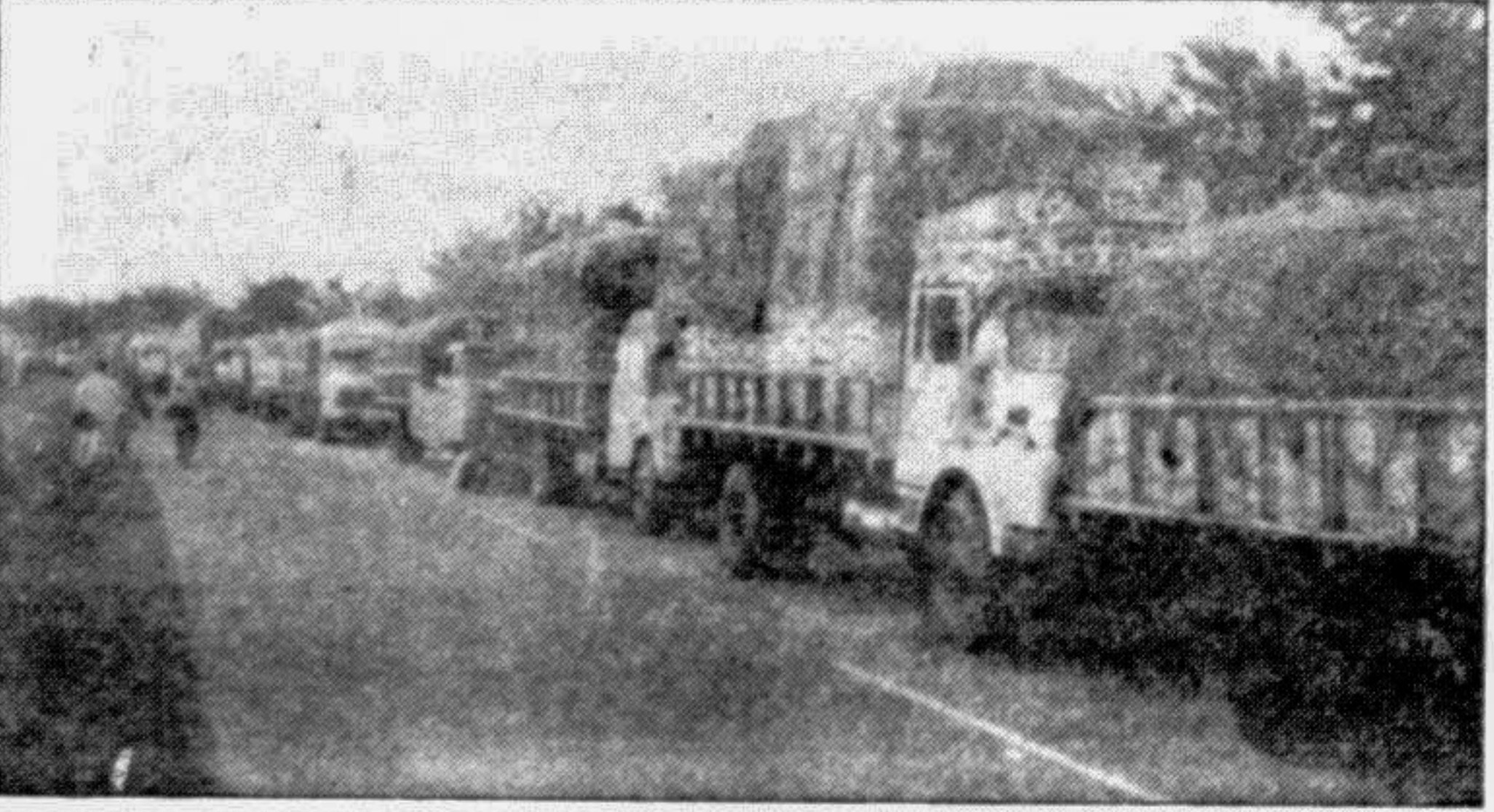
GAIBANDHA: Hundreds of loaded trucks remained stranded at different locations of the national highway. This photo was taken on October 5 last.

of two bridges at Kalitola and Taltola under Gobindaganj thana. With the breaching at two points of the flood protection embankment movement of traffic remain suspended. As a result, hundreds of bus, truck and other vehicles remain stranded on both the sides. Roads and Highways Department although earlier started precautionary measure with brick-bates and sand bags to stop overflowing of flood water but all in vain. The rushing water inundated highway within the course of next few hours on September 30. The situation further aggravated with the collapse of two bridges. Roads and