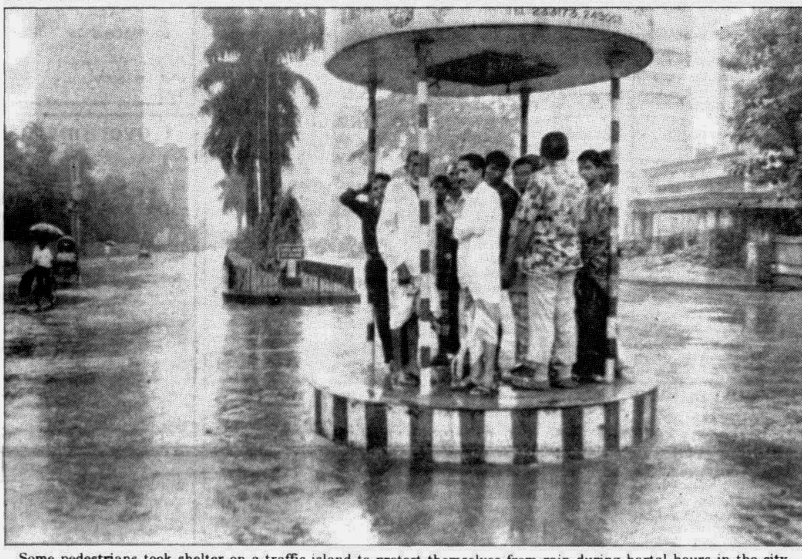
Some pedestrians took shelter on a traffic island to protect themselves from rain during hartal hours in the city yesterday.