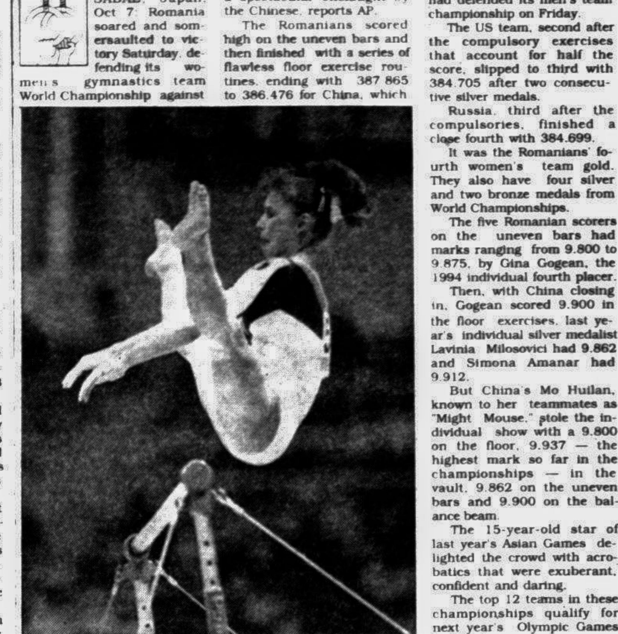
Romania's Lavinia Milosovici competes on the uneven bars on the final day of the women's team event at the World Gymnastics Championships in Sabae, Japan yesterday.