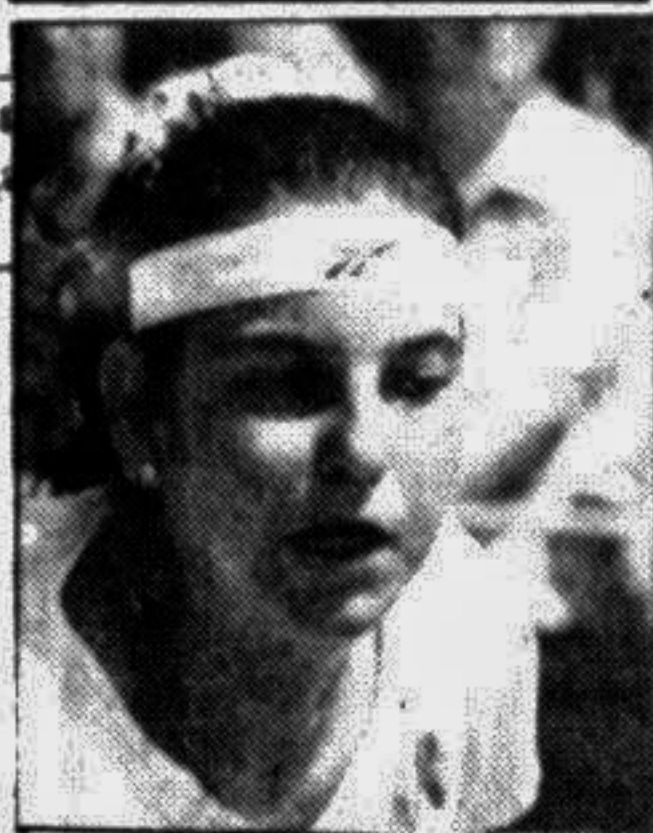
Arantxa Sanchez-Vicario (Spanish tennis star) "Before, I was Emilio's sister; now my brothers are Arantxa's brothers." About the changed realities.