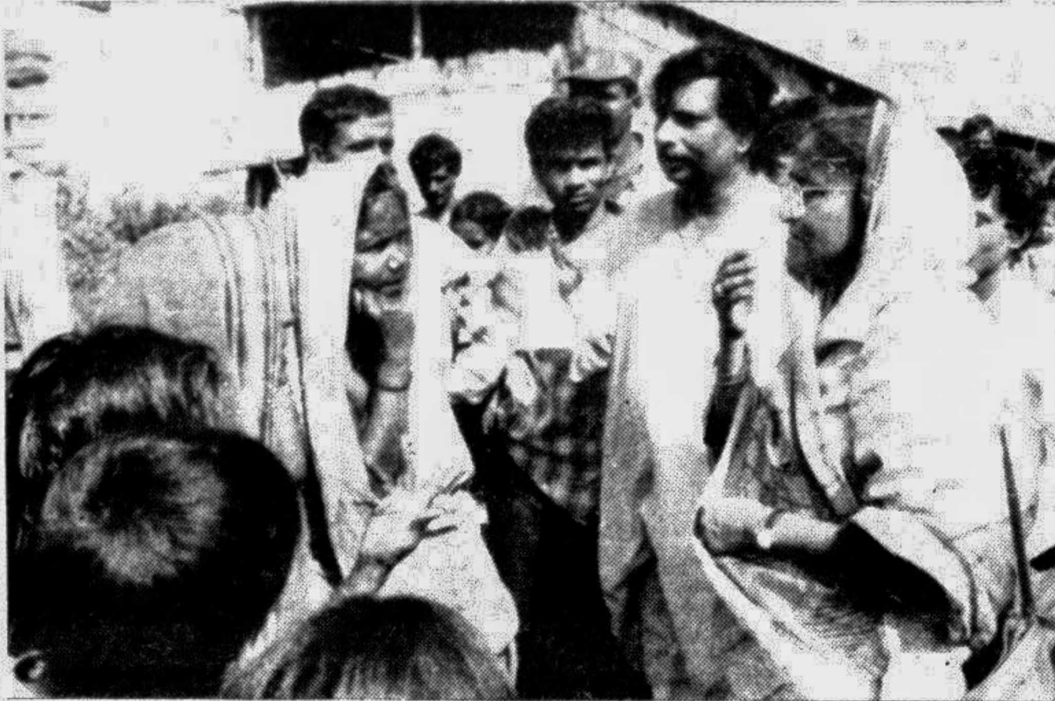
Awami League chief Sheikh Hasina talking to some flood victims during her visit to Pabna yesterday. Story on Page 1