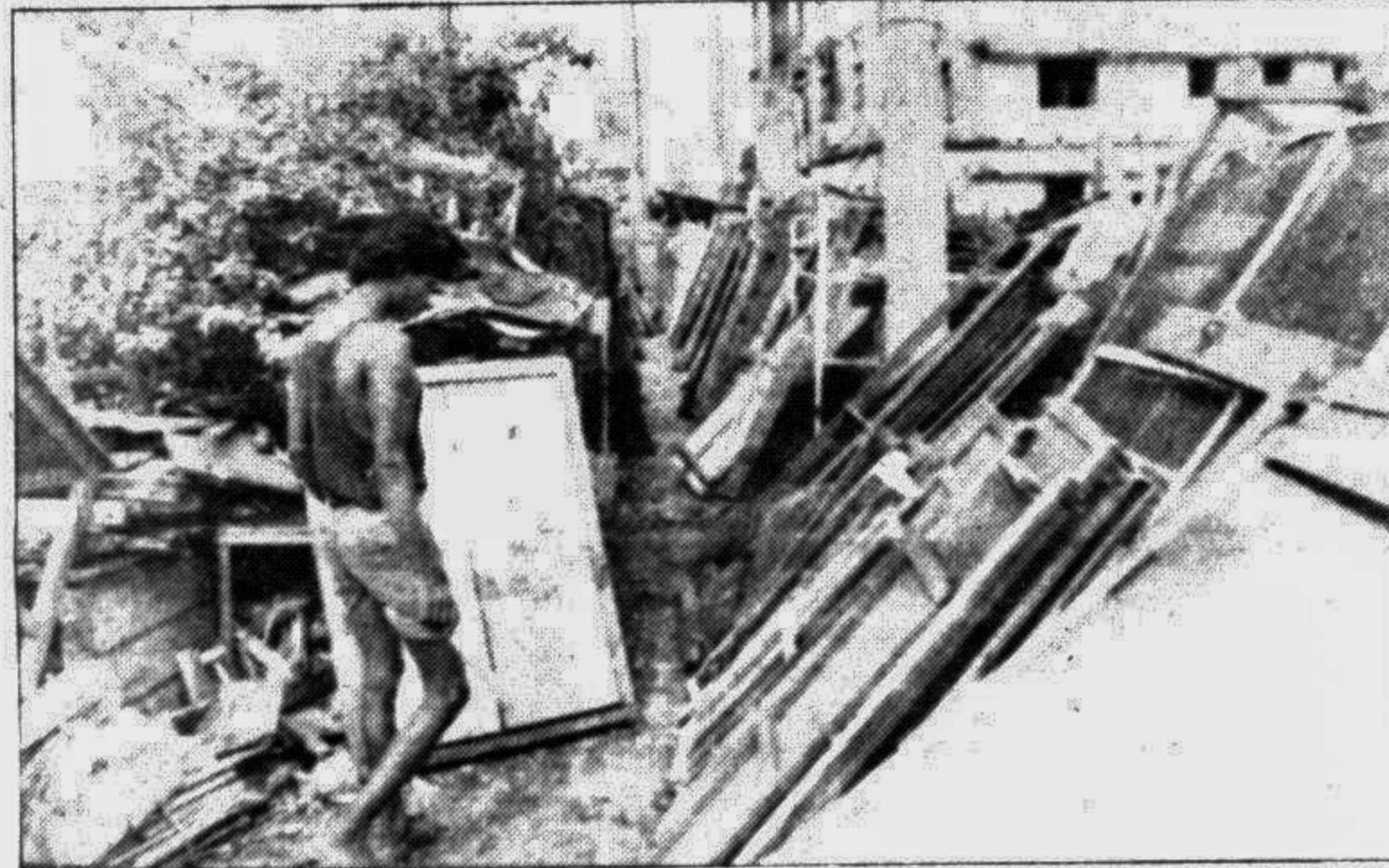
This picture, taken from the city's Panthapath thoroughfare yesterday shows the joint drive by Dhaka Metropolitan Police (DMP) and Dhaka City Corporation (DCC) against occupants of pavements is yet to trigger any threat to them.

ICMAB classes will resume on October 11 instead of October 9, says a press release.