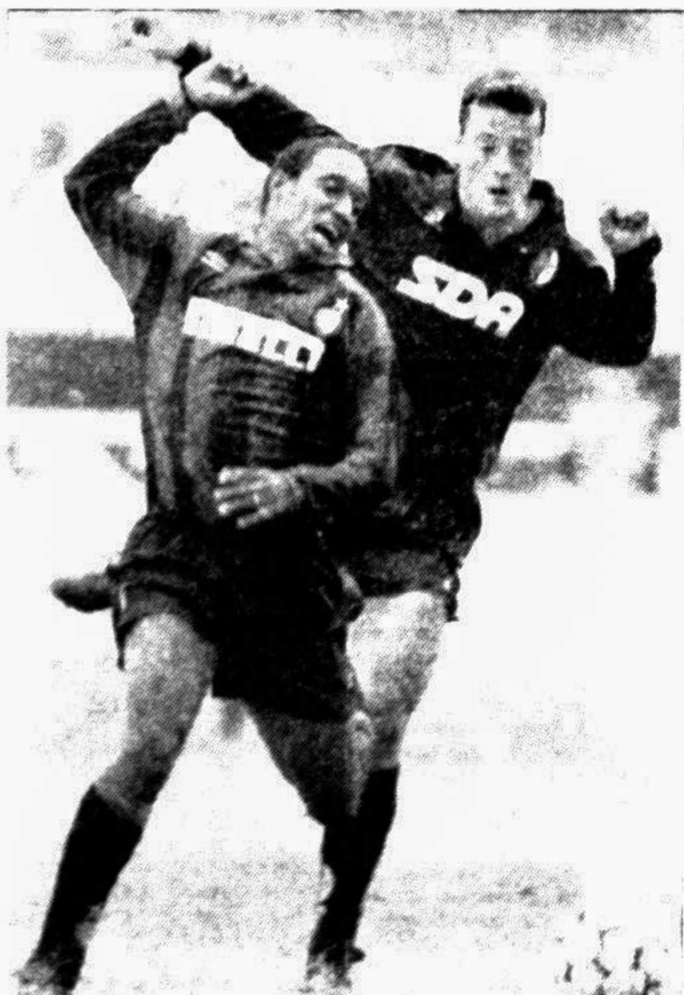
Paul Ince (L) of Inter Milan battles for possession with Torino's Paolo Cristallini during a Serie A clash on October 1. Torino were thrashed 0-4.

In all the trial generated more than a million lines of transcribed data, the company said, and featured 16,000 objections, 500 apologies and 300 sidebar conferences.