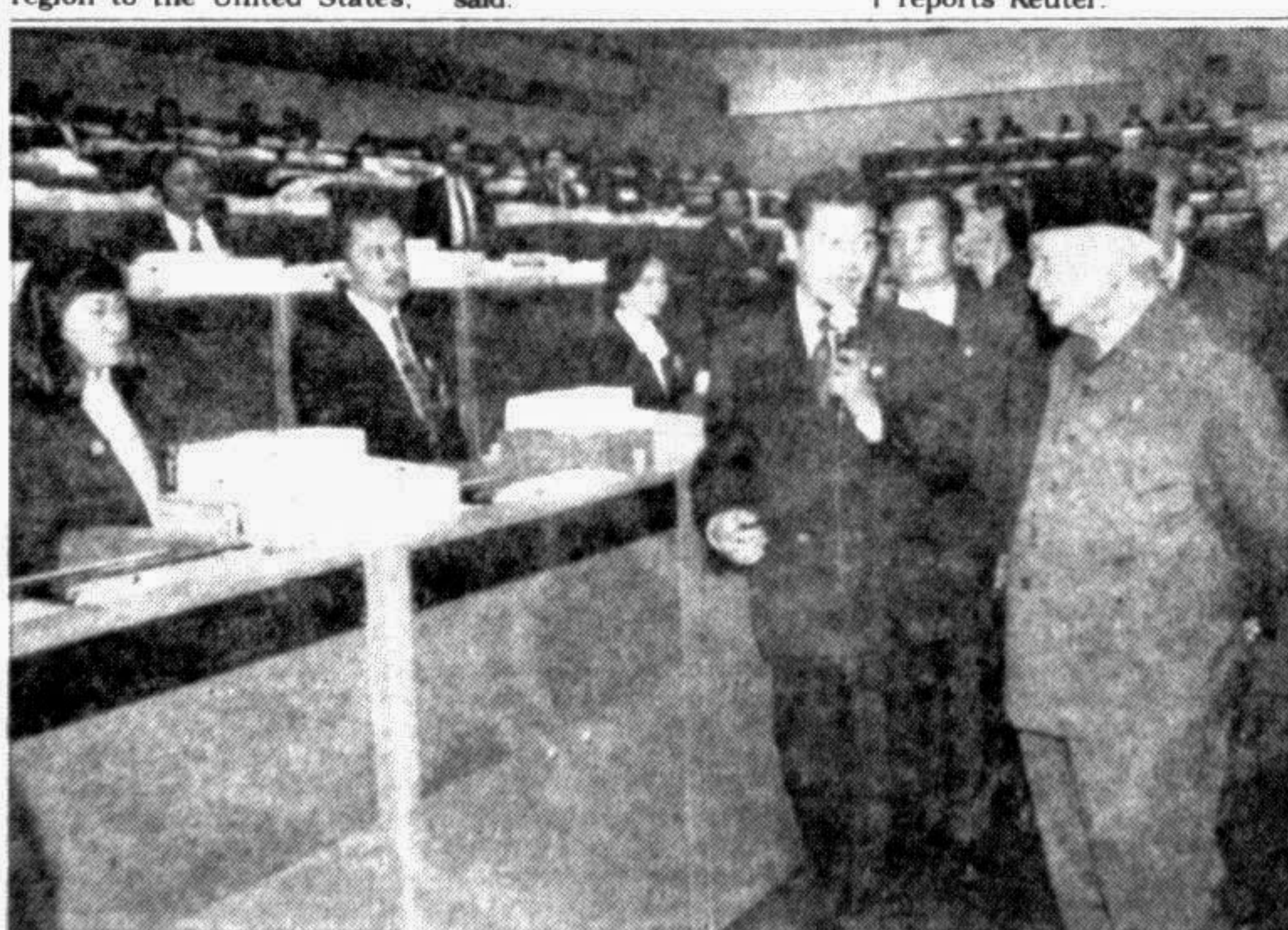
Indonesian President Suharto (R) tours the Jakarta Stock Exchange during an inauguration ceremony in Jakarta yesterday. Suharto officially opened the Jakarta automated Trading System which has been operating for the last five months. The computerised system has vastly improved trading efficiency in Indonesia's fledgling capital market.

ording to UN estimates. Japan already agreed this summer to provide 300,000 tons of grain, half of it free. South Korea has delivered most of the 150,000 tons of rice it promised to provide for free and has offered more in negotiations. Under Tuesday's deal, North Korea will have a 10-year grace period followed by a 20-year repayment period at 3 per cent interest, the diplomat said. He refused to disclose the price. The rice will be taken out of surplus stocks built up from imports to meet a shortage in Japan last year, the diplomat said. North Korean ships will take delivery in Japanese ports, perhaps as early as this month. The diplomat said the rice must first be gathered from storage sites around Japan. No other topics were discussed in the talks in Beijing, including normalization of relations, the diplomat said. Talks on formal diplomatic relations were conducted between the countries in 1992 but then broke down. Talks on further aid between rival North and South Korea broke down in Beijing on Saturday.