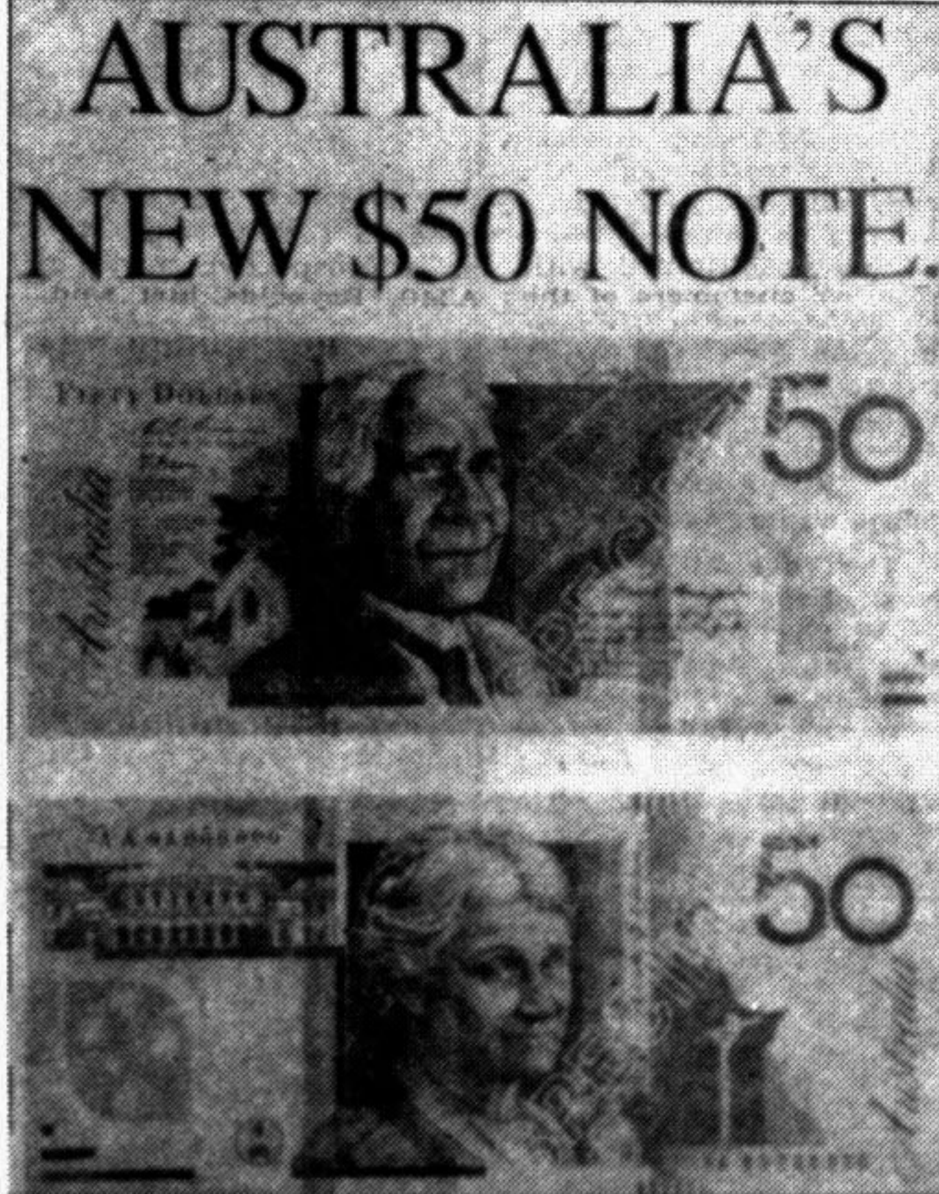
The new Australian $50 note features Ngarrindjeri Aboriginal author and inventor David Unaipon 1872-1967 (top) and social worker Edith Cowan 1861-1932 (bottom) who became the first female member of the Australian Parliament October 3. The counterfeit-proof, golden polymer note goes into circulation today.

WASHINGTON, Oct 3: Capital account convertibility is highly desirable but not always practicable, though steps should be taken towards the goal of convertibility, says the Managing Director of the International Monetary Fund (IMF), Michel Camdessus, reports PTI. In an article in the Wall Street Journal that appeared to analysts to fully justify Finance Minister Manmohan Singh's caution on capital account convertibility, Camdessus draws a clear distinction between what is desirable and what is possible. Camdessus points out that today 105 countries have committed themselves to current account convertibility of their currencies under the charter but successful capital account convertibility needs fulfillment of certain prerequisites and without them the exercise would be reckless and could also lead to the collapse of the financial system.