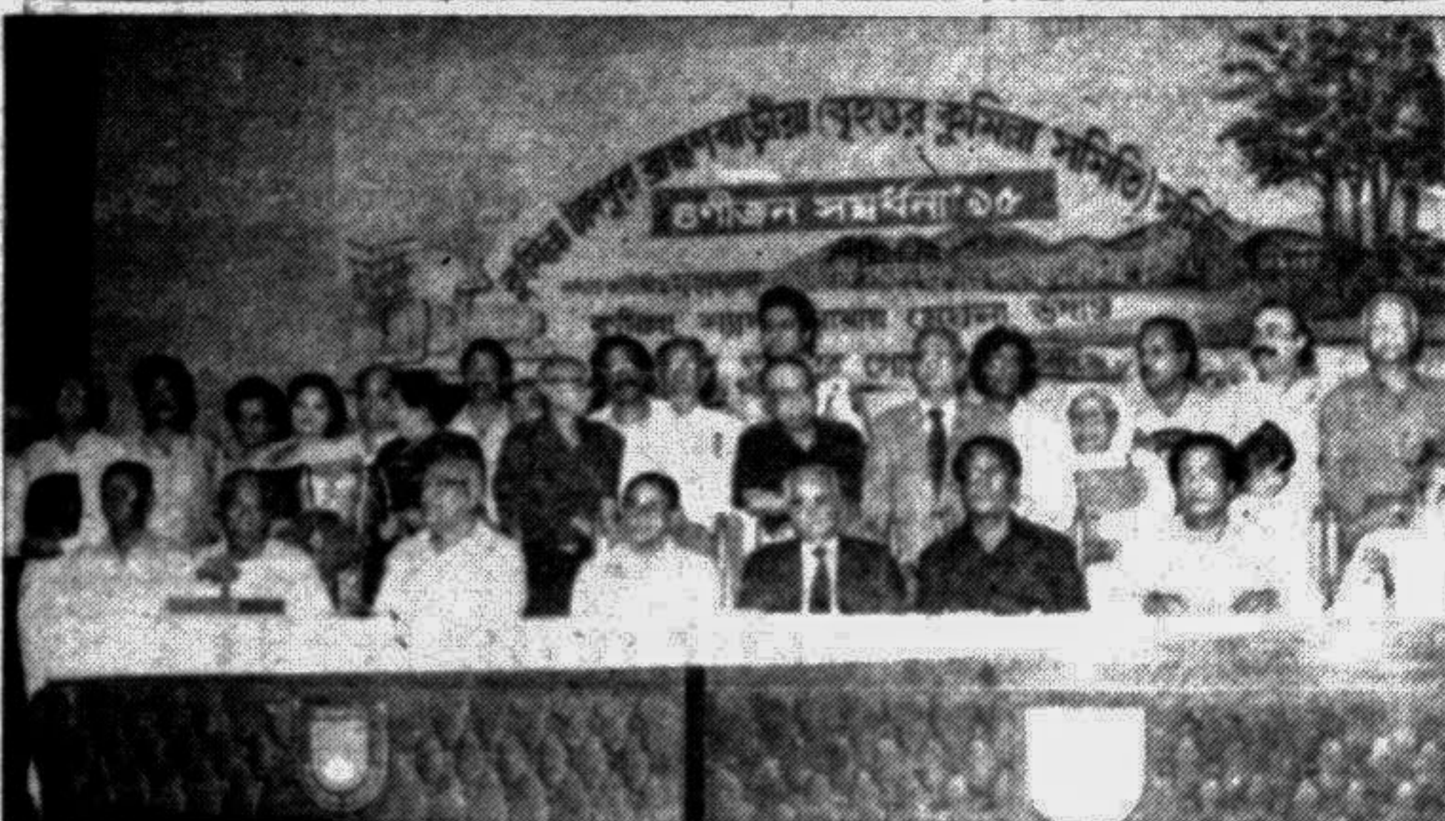
President Abdur Rahman Biswas among the recipients of distinguished personalities award '95 organised by the Greater Comilla Association in the city on Saturday.