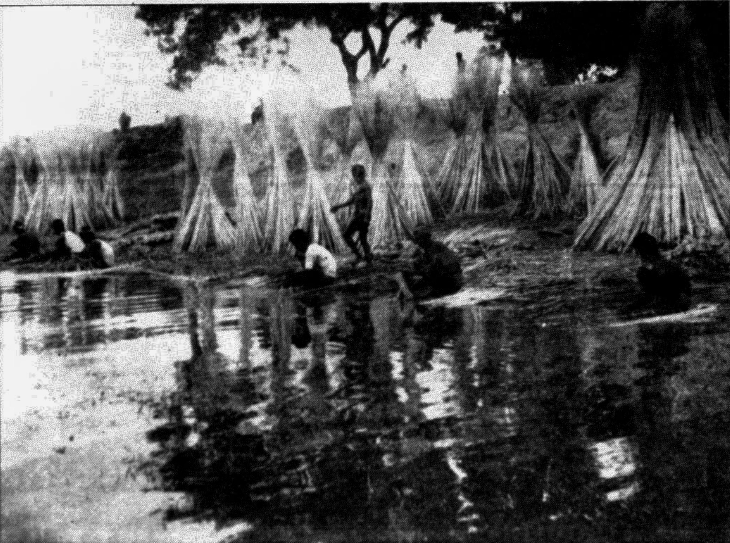
SHERPUR: The farmers are cleaning the jute fibres in Shurika Beel in Kameron Char of the district. Jute production, however, was not satisfactory in the district this season. The crop production target fell short by more than 70 per cent in the district according to official sources.

It may be mentioned here that Rajshahi Samaj Unnayan Karma Sangstha is working in the region of greater Rajshahi district with a view to help the poor and wealthless people by granting them loans on income generating professions under close supervision. It distributed loans amounting to Taka 60 lakh 20 thousand last year. The rate of loan recovery is about 100 per cent, it is learnt.