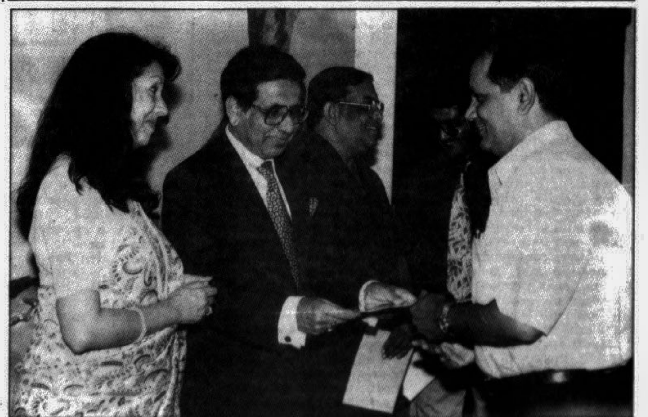
Picture shows the Chairman & Managing Director, Singer Bangladesh Limited, giving away the certificates to the participants.