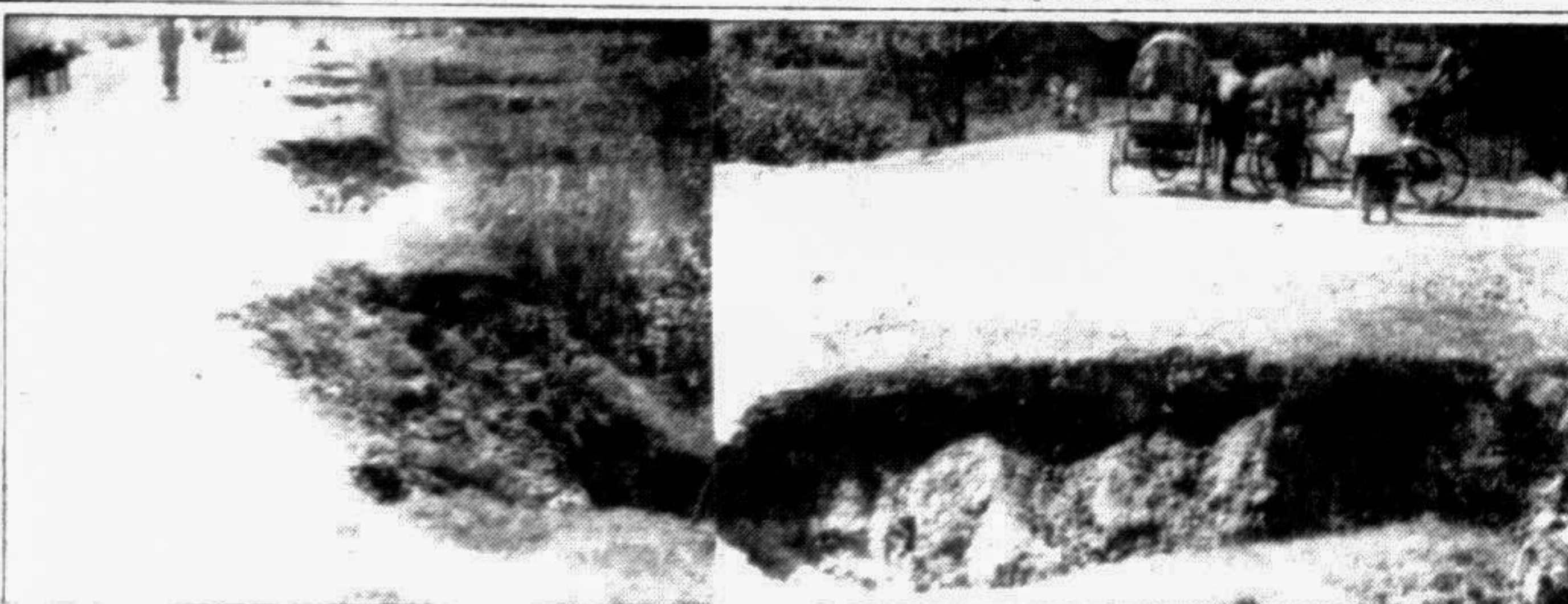
SHERPUR: The Sherpur-Kamarchar highway (L) constructed by the Local Government Engineering Department at a cost of Taka 5 crore was badly damaged by the recent flood. The Jamalpur-Kamalpur road (R) constructed by Roads of Highways Department was also damaged by the recent flood. The concerned departments have not yet started work to repair the damaged parts of the roads.

However most of the ghani owners can not afford to buy bullocks as they are expensive. The oilmen are also facing fund shortage. Procedure of bank loan disbursement is too complicated, they said. The oilmen are left with no other alternative but to borrow money from money lenders or mahajans at much higher rates of interest.