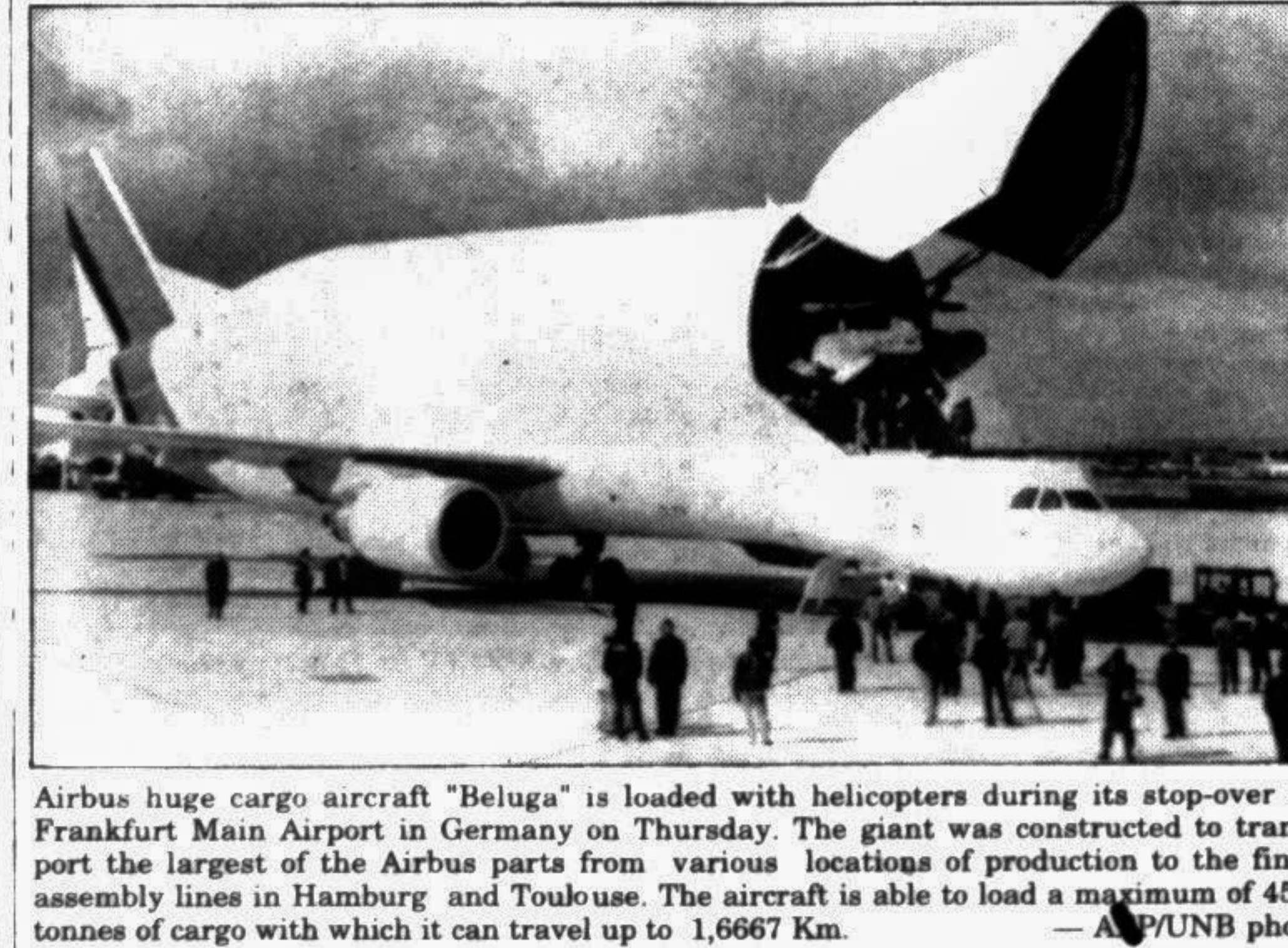
Airbus huge cargo aircraft "Beluga" is loaded with helicopters during its stop-over at Frankfurt Main Airport in Germany on Thursday.

VIETNAM, Sept 29: Consumer prices rose by 0.5 percent in September, due largely to seasonal floods that made rice more expensive in Vietnam's biggest granary, an official report disclosed Friday, reports AP.