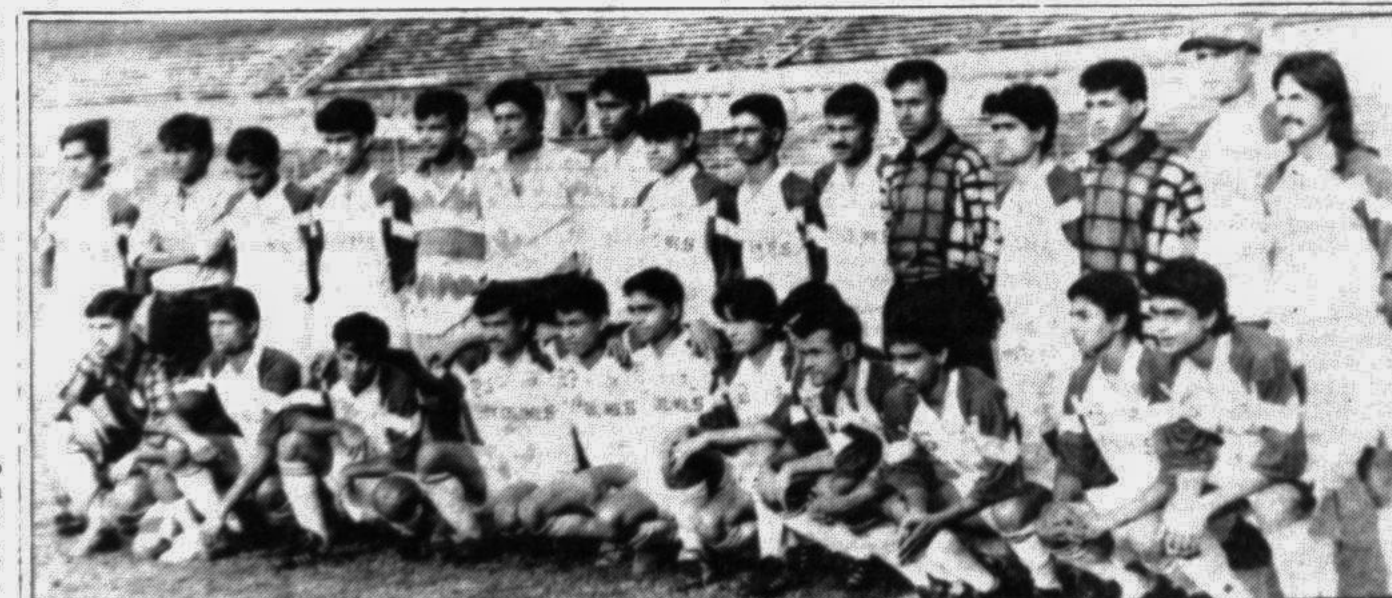
The players and officials of the East End Club who became champions in the Lifebuoy First Division football league, will compete in the Premier League next season.

RIO DE JANEIRO, Sept 28: A young Brazil team, dubbed "the future of Brazilian football" by coach Mario Zagallo, drew 2-2 against an equally untested Romanian selection in an international soccer friendly Wednesday, reports Reuter.