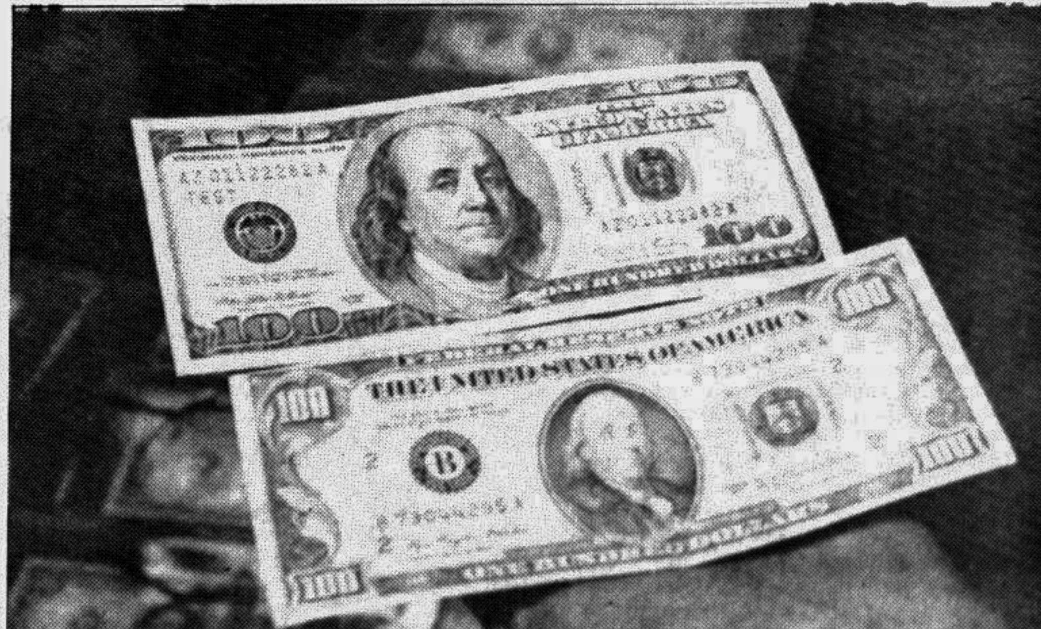
An old 100 USD bill and a new 100 USD bill (top) are held up on during an unveiling at federal building in Los Angeles on September 27. The new bills are due to be circulated into the treasury in 1996.