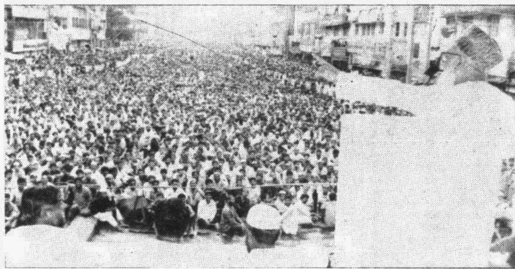
Ameer of the Jamaat-e-Islami Bangladesh Golam Azam addressing a rally at the Shapla Chattar in city's Motijheel area yesterday.