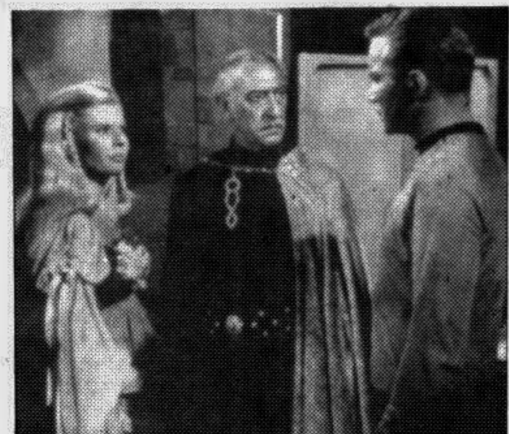
Star Trek on Star Plus

6:00am Chinese Men's Basketball Preliminary From Beijing 10:00 National In-Line Skating Series: From San Francisco 11:00 Bud Pro Surf Tour From Virginia Beach 12:00 Camel Trophy 1995 1:00 Pakistan v Sri Lanka 3rd Test Day 1 H/L 2:00 Triathlon Pro Tour 1995 From Switzerland 3:00 World Wrestling Federation Wrestling Mania 4:00 The Asian Football Cup 5:00 Motorcycle G P Highlights 5:30 European Truck Racing, 1995 6:00pm Live Chinese Men's Basketball Semi- Final From Beijing 10:00 Pakistan v Sri Lanka 3rd Test Day 2 H/L 11:00 World Wrestling Federation Wrestling Mania 12:00pm Triathlon Pro Tour 1995 From Switzerland 1:00 Motorcycle G P Highlights 1:30 European Truck Racing, 1995 2:00 Champions Tour Big Bear Champions From