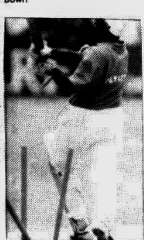
Pakistan v Sri Lanka 3rd Test on Prim Sports, Today at 1 pm

based on Secondary School students: Shiksa-Dhika 12:30 Programme summary Close down