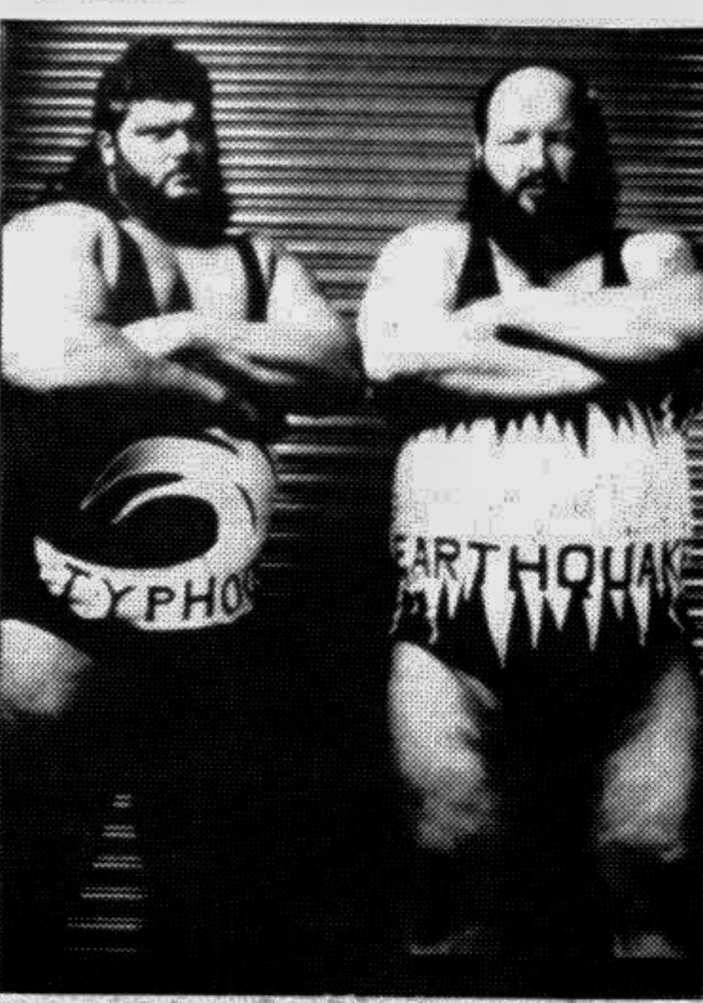
WWF Wrestling Mania on Prime Sports, Today at 3 pm

Rainbow Italian Ice-Cream Pioneer of Italian Ice-Cream in Bangladesh (1987) Ctg. 21 Delicious Flavours 33, South Gulshan Avenue, 1st Circle, Dhaka; Ph 606078 969, O. R. Nizam Road, Chittagong.