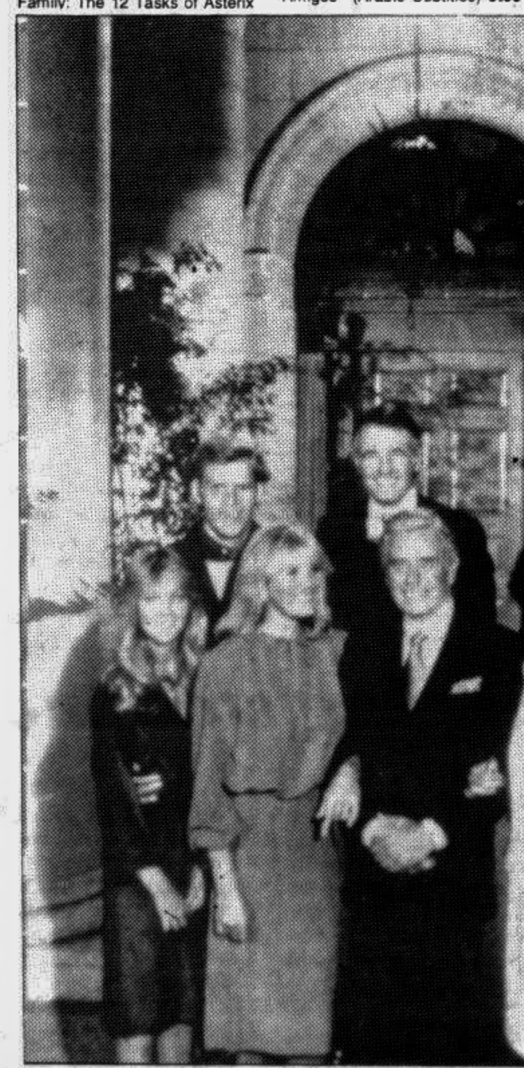
Dynasty on Star Plus, Tonight at 9:30

7:30 Romance: A Woman Of Independent Means Part III (Arabic Subtitles) 9:30 Family: The 12 Tasks of Asterix (Arabic Subtitles) 11:30 Comedy: Throw Mania From The Train (Arabic Subtitles) 1:30 Classic: Gift Of Love (Arabic Subtitles) 3:30 Family: Waterstep Down (PG) (Arabic Subtitles) 5:30 Swaabuckler: The Mark Of Zorro (Arabic Subtitles) 7:30 Comedy: The Three Amigos (Arabic Subtitles) 9:00