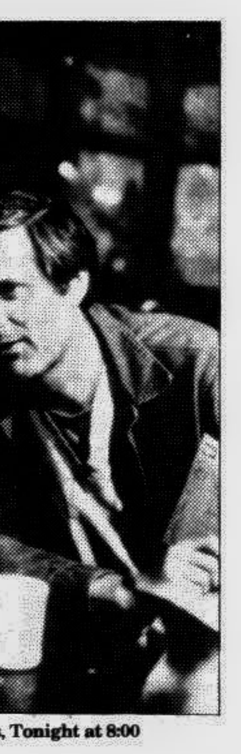
MASH on Star Plus, Tonight at 8:00

2:30 Opening announcement 2:40 Retelecast from the Tripakt 3:00 Bengali Feature Film 5:10 News in Bangla 6:00 Documentary Film: The World at War 7:00 Open University 7:10 Modern songs: Malancho 7:45 Anader Chiti Pelam 8:00 News in Bangla 8:30 Film Show: Arabian Nights 9:00 Ittyadi: Magazine Programme 10:00 News in English 10:25 Janmahumi: Retelecast of Documentary Programme based on development 10:30 Drama Series: Nyrd Blue 11:30 Khabar/The News 11:40 Tomorrow's programme summary 11:45 Close Down