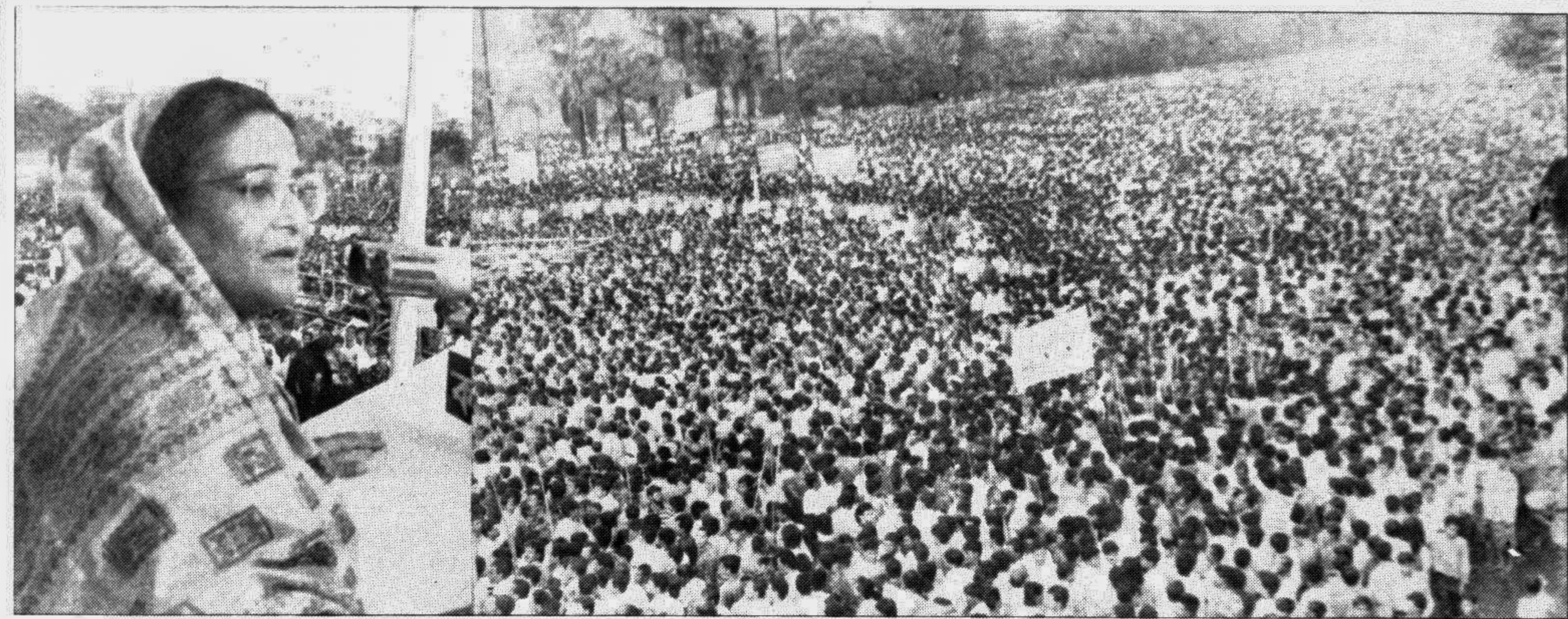
Awami League President Sheikh Hasina addressing the party's grand rally at the Manik Mia Avenue in the city yesterday afternoon.