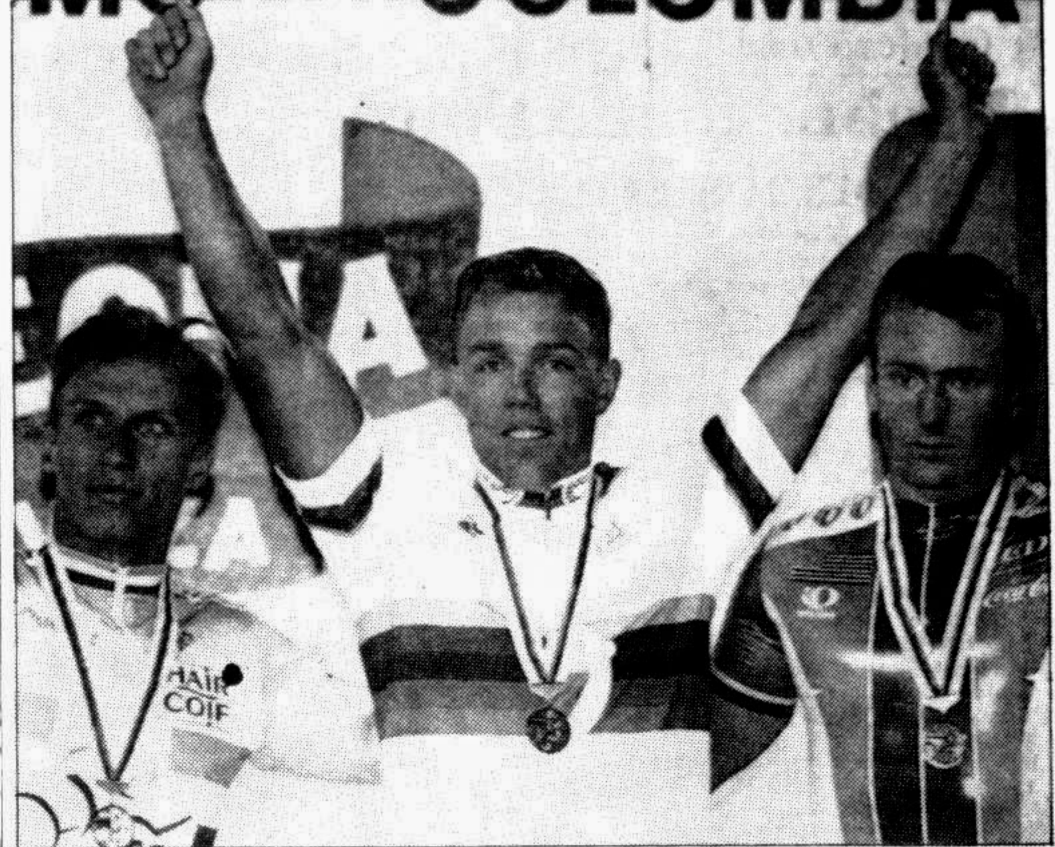
World one-kilometre cycle race winner Shane Kelly of Australia (C), flanked by second placed Florin Rousseau (R) of France and third placed American Erin Hartwell, waves to the crowd at Bogota, Colombia on September 26.

Spectators watching the match on the 107th floor of