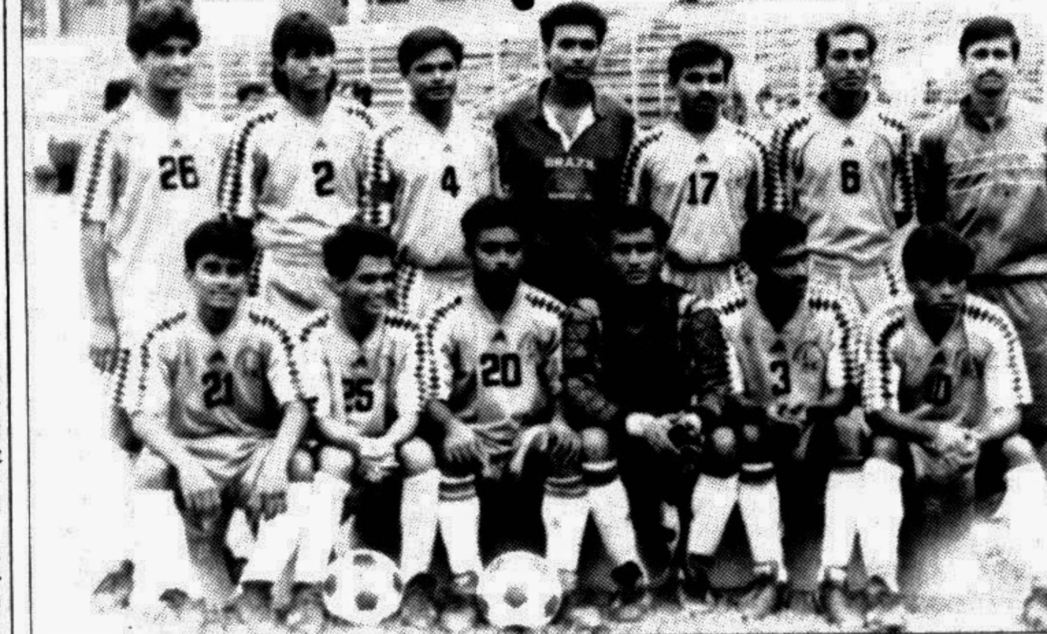
Bangladesh Boys Club, who have become runners-up in the Lifebuoy First Division football league this year, poses for a photograph prior to their yesterday's penultimate league clash against Victoria SC at the Dhaka Stadium.

Deportivo Coruna will be without Brazilian midfielder international Mauro Silva but will otherwise be at full strength when they take on Apoel of Nicosia after a scoreless draw in the first leg.