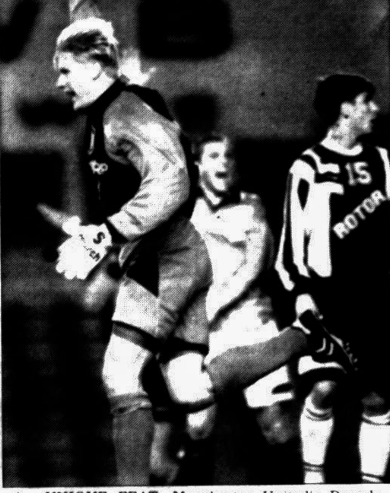
A UNIQUE FEAT: Manchester United's Danish international custodian Peter Schmeichel exults after scoring a goal against Rotor Volgograd during the second-leg of the UEFA Cup first round match at Manchester, UK on September 26.

"What can I say? We've got to keep working. This is a terrible defeat but we can't dwell on it for very long," said Pagliuca, visibly shaken by one of the biggest mistakes of his career.