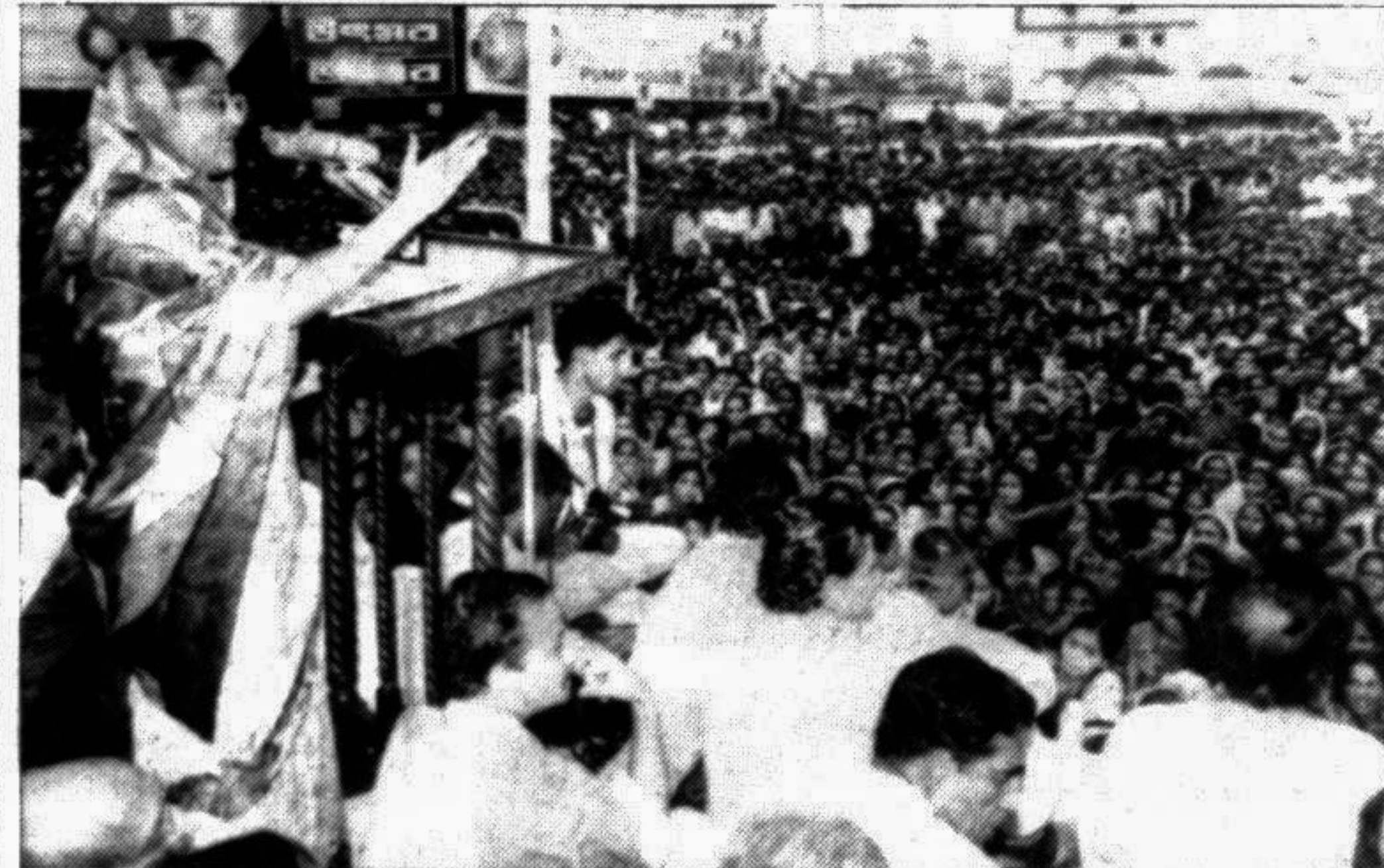
Awami League President Sheikh Hasina addressing a public meeting at the intersection at Mirpur No.10 yesterday.