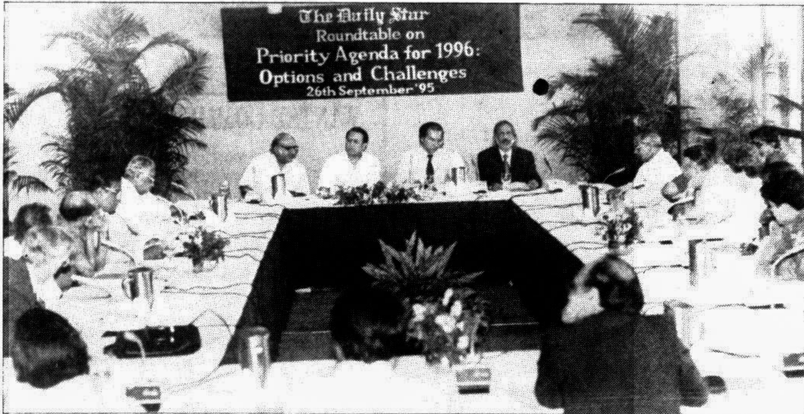
The Daily Star organised a roundtable on 'Priority Agenda for 1996: Options and Challenges' at a city hotel yesterday.