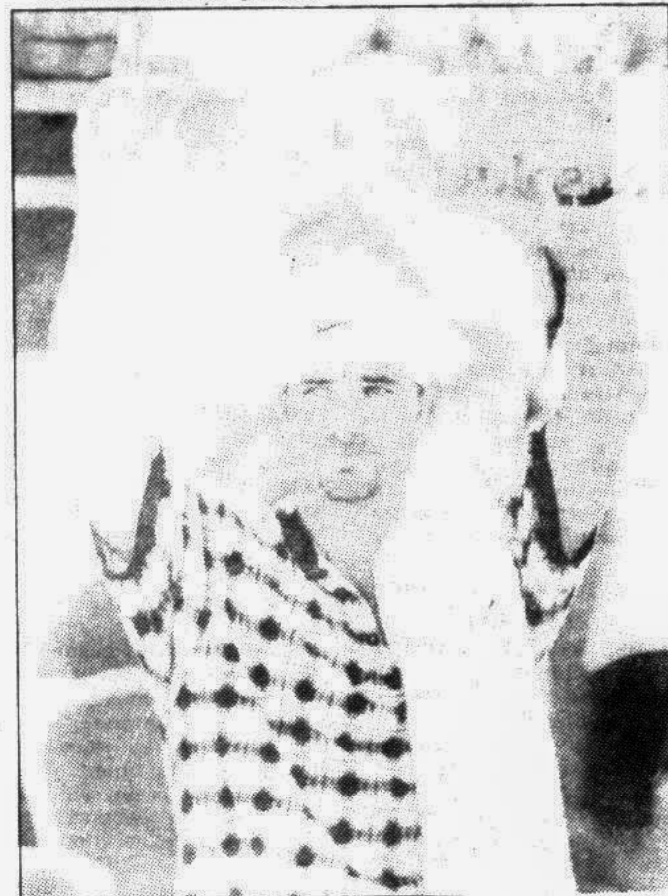
World number one Andre Agassi of the United States waves to his adopted hometown crowd after winning his Davis Cup semifinal match against veteran Swede Mats Wilander 7-6, 6-2, 6-2 in Las Vegas on Sept 22. The Americans took a 2-0 lead on the first day.

Sampras battled Enqvist mightily from the baseline in the third game before forcing Enqvist into a forehand cross-court error on the game's sixth break point to take a 2-1 lead.